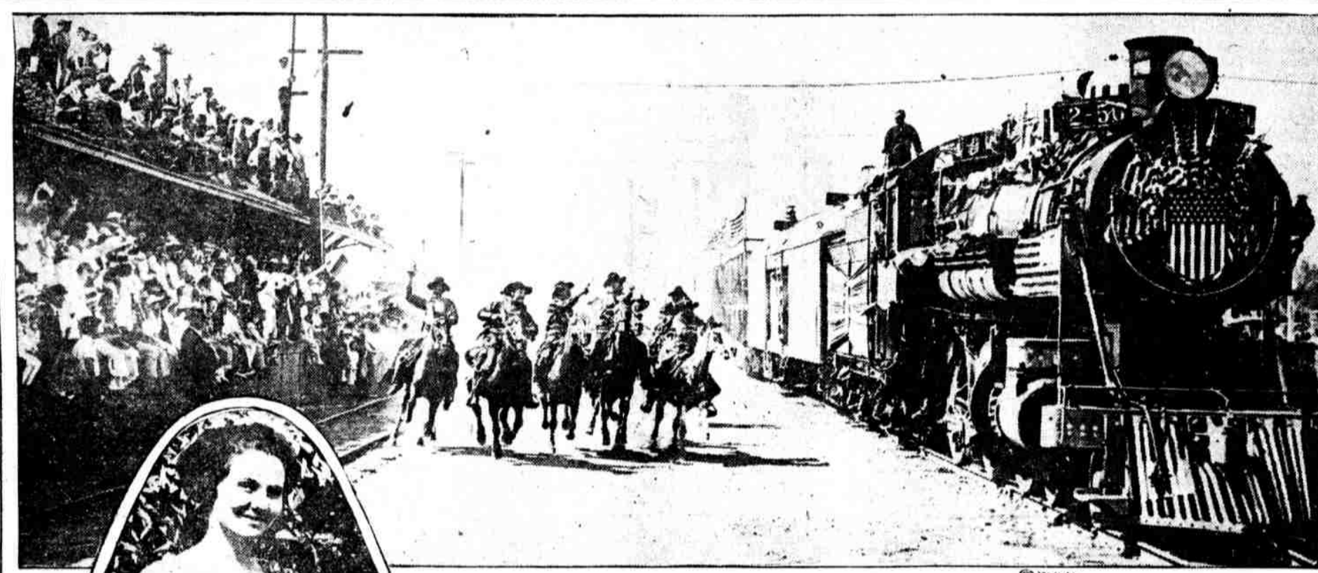
HOLDING UP A VICTORY LOAN TRAIN IN MID-WEST STATE. The special of the Loan Committee was thundering through San Fernando, California, at the dizzy speed of five miles an hour when twenty horsemen dashed from their lair. The entire town had turned out to see the show. W. S. Hart, famous two-gun man of the movies, was chief of the hold-up band. The train will tour the South-west in aid of the Loan.