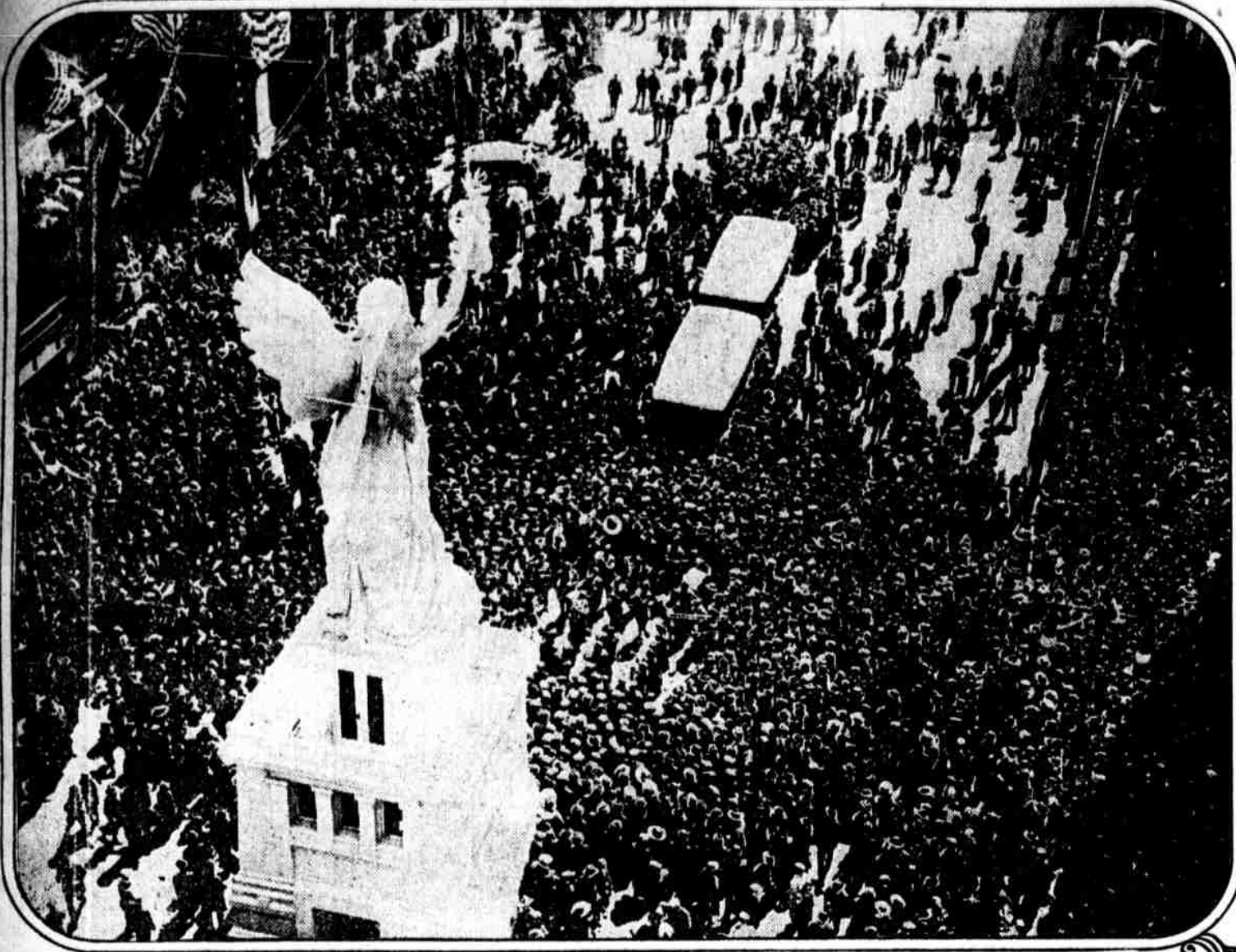
"JAZZING" for Victory. A Loan band concert on South Penn square in front of the Victory Statue