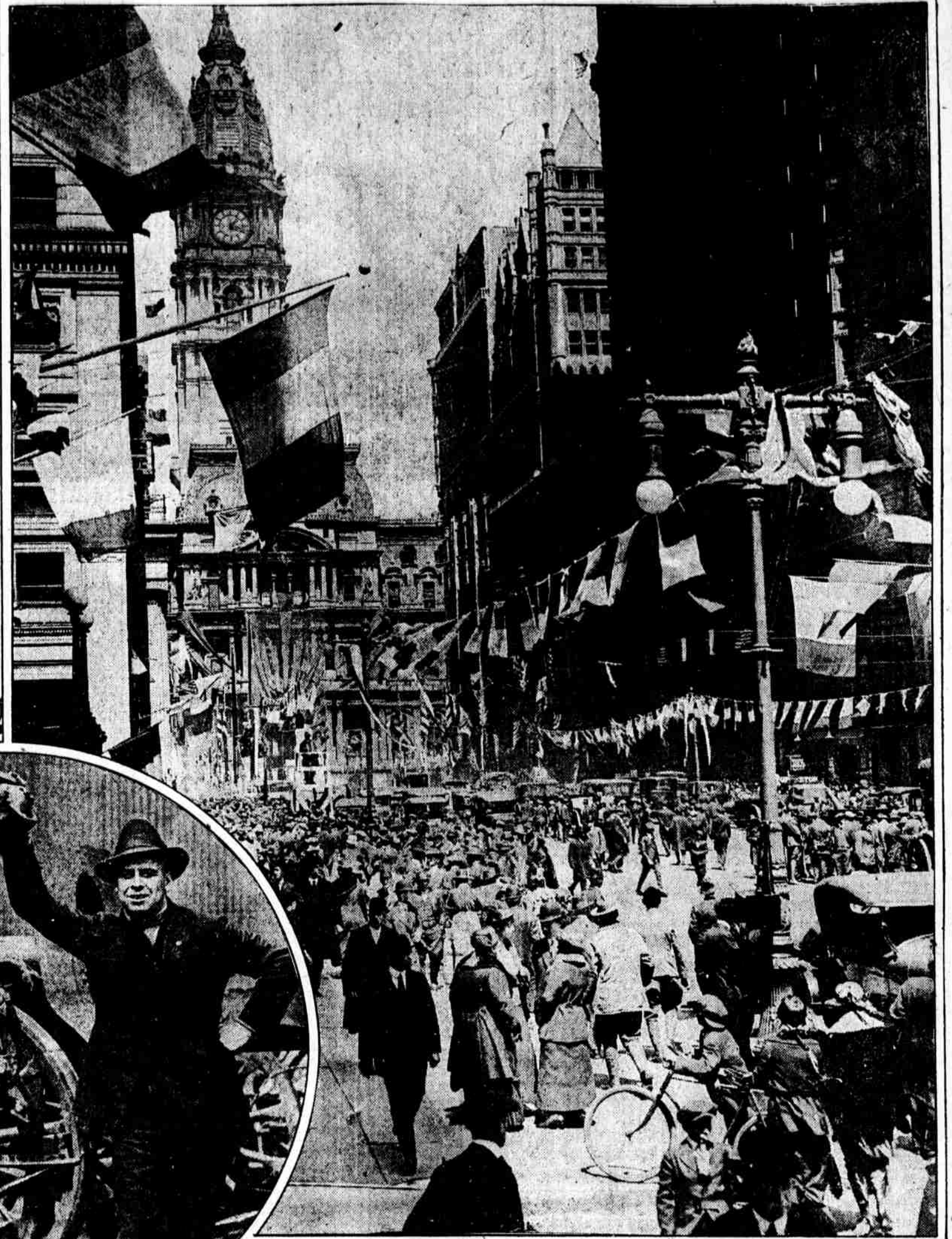
VICTORY WAY on Broad street, with trophies of war and gay with fluttering Allied colors, was the center of the Loan activities