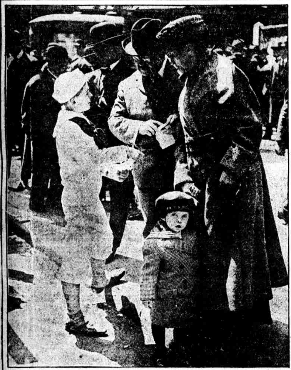
A YOUNG BOND salesman of St. Monica's Junior Naval Establishment explaining the merits of the investment