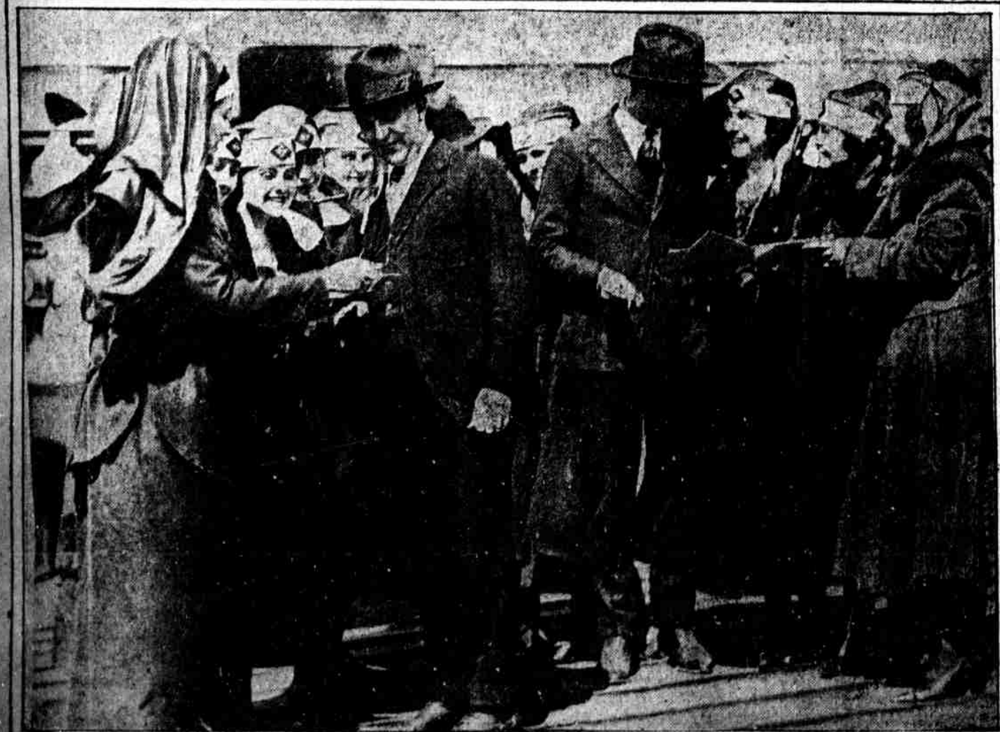
"BUY, BUY, BUY!" resounds throughout the town. Busy workers of the Philadelphia and Reading Railway Women's Victory Loan Committee campaigning for the Loan