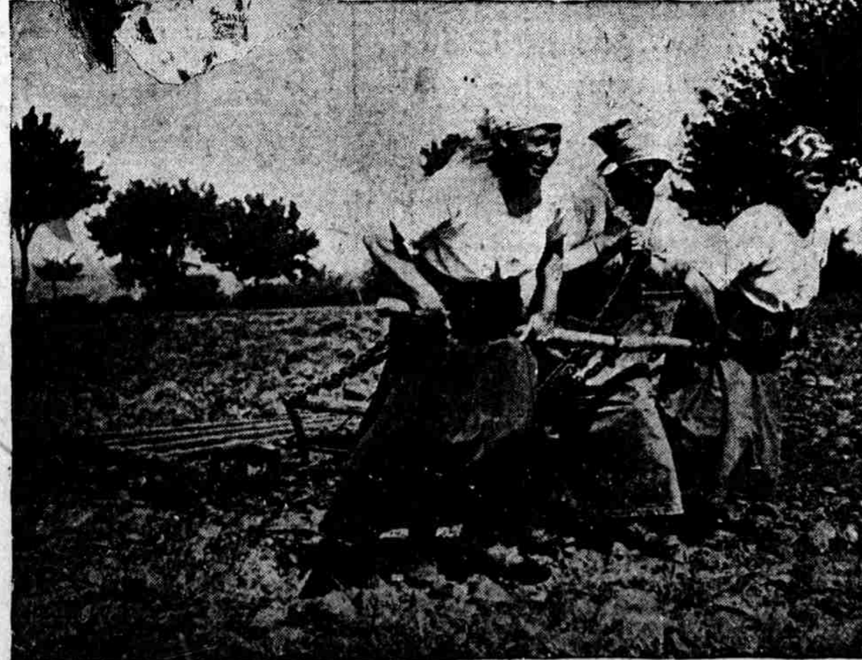
Judge Ben B. Lindsey, of Denver Juvenile-Court fame, writes for May Cosmopolitan, an interesting article in which he claims that women are at least entitled to the same rights as horses. Read the article and ponder over this subject which is to-day one of the world's greatest problems.