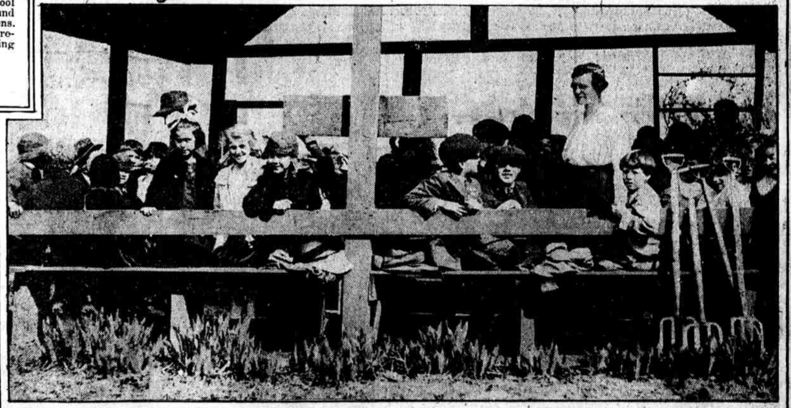
EVERYTHING IS IN SHAPE for the children to start their garden work on the school lots. Before beginning work on the ground itself, teachers explain how, when and where to plant the seeds and tend the vegetables. Vacant lots and lawns are being given over to the children for their gardens.