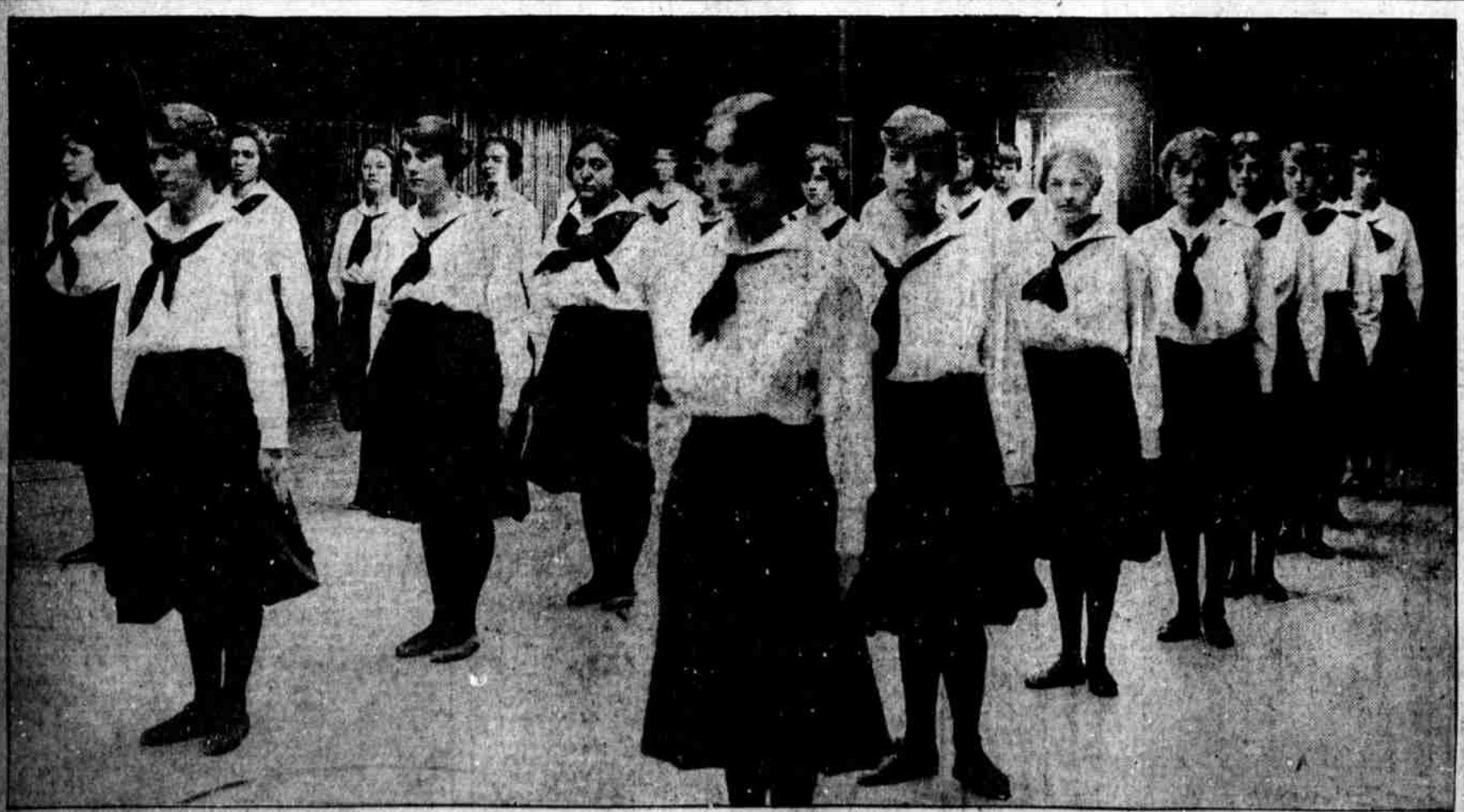
GIRLS OF the Philadelphia Normal School, Seventeenth and Spring Garden streets, in gymnastic drill. The senior and junior classes of the school held their annual athletic meet yesterday. Silver cups were awarded as first and second prizes to individual girls gaining the most points