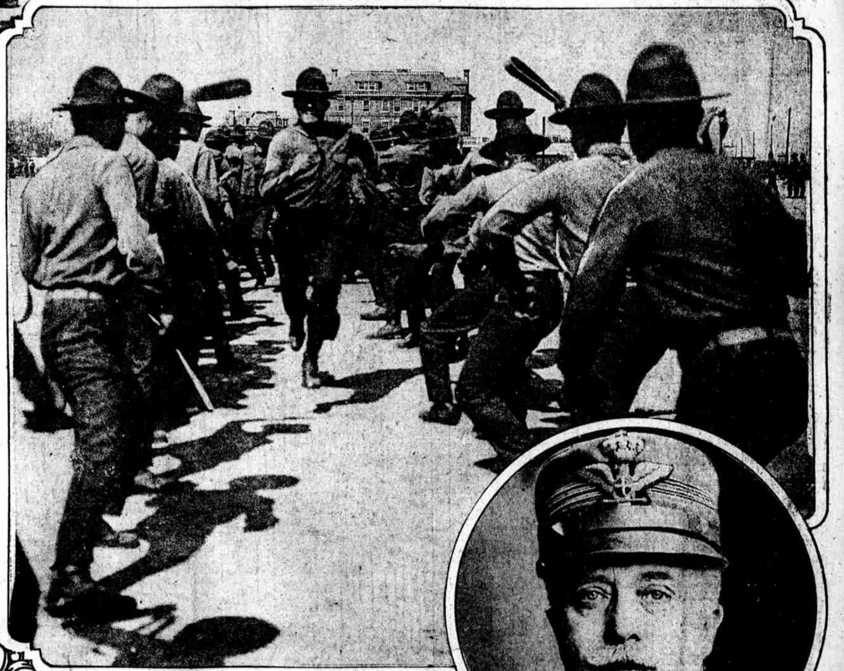
"BELTING" THE LOSERS. Candidates for prizes in next Wednesday's sports at League Island must win the trial events or run the gantlet of a lane of very active belts.