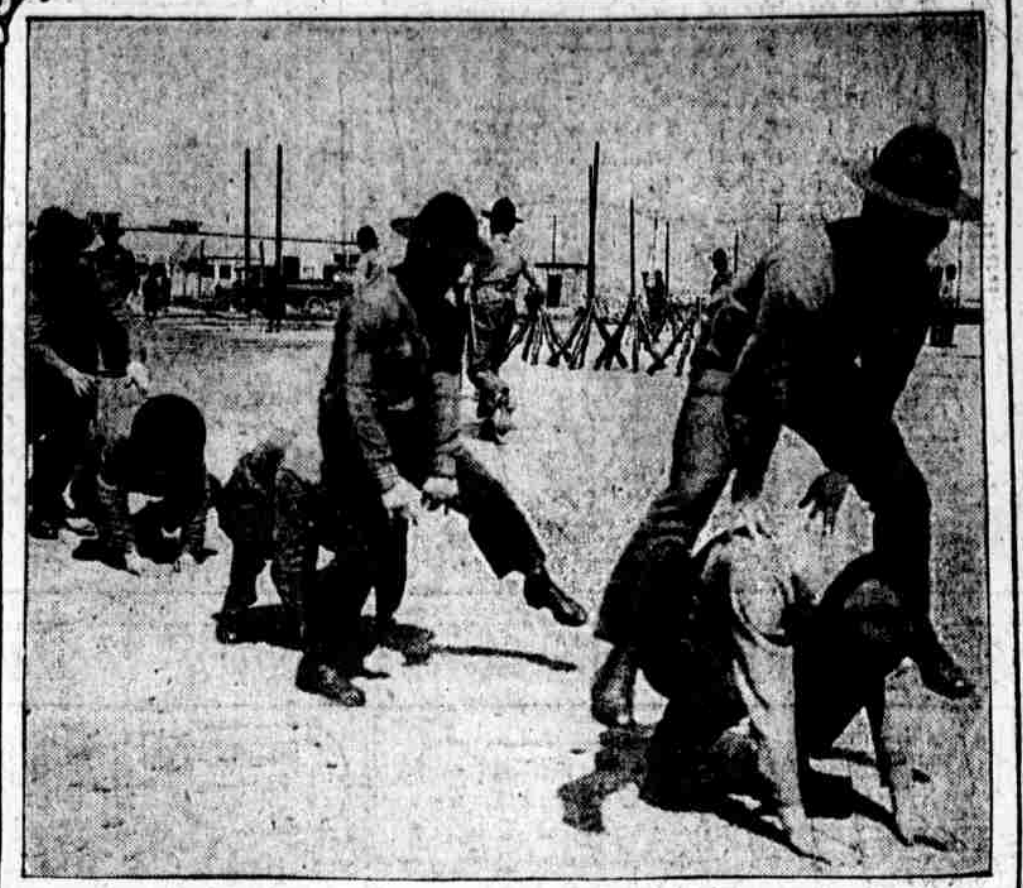
LEAP FROG CONTEST—The sport of youth will be incorporated in the marines' program