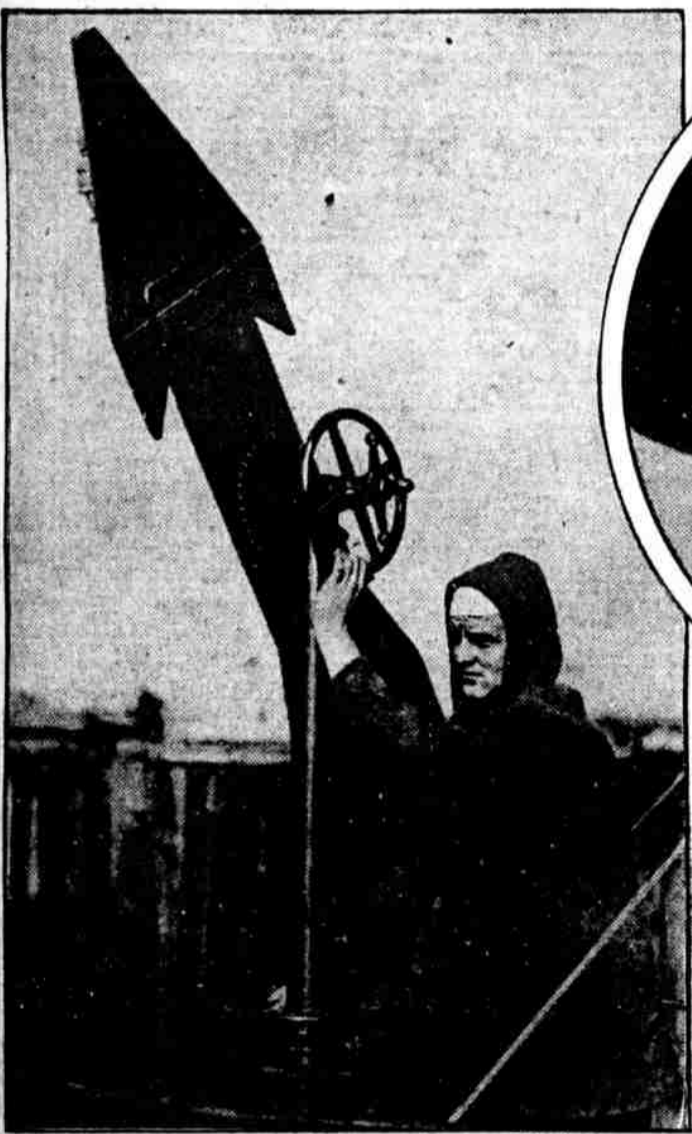
Keylong, V.C. Photo---