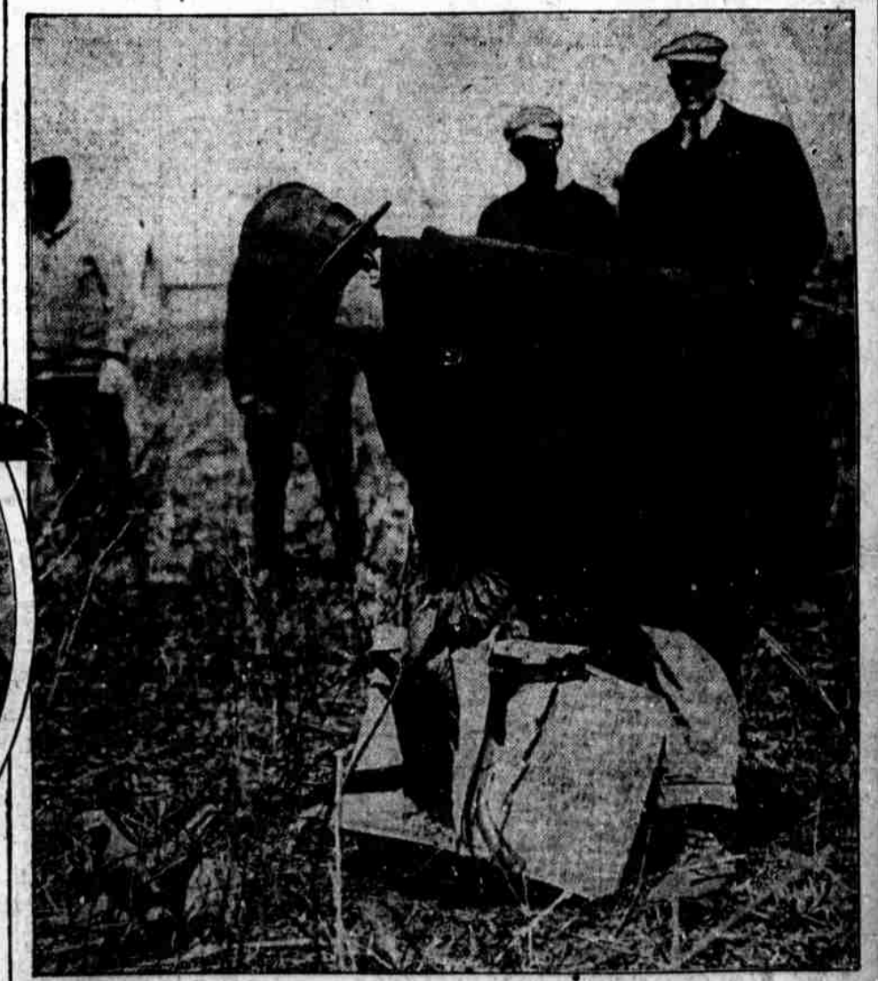
LIBERATING A HEN PHEASANT. The 160 birds set free are expected to raise 1000 young ones, if the season is good.