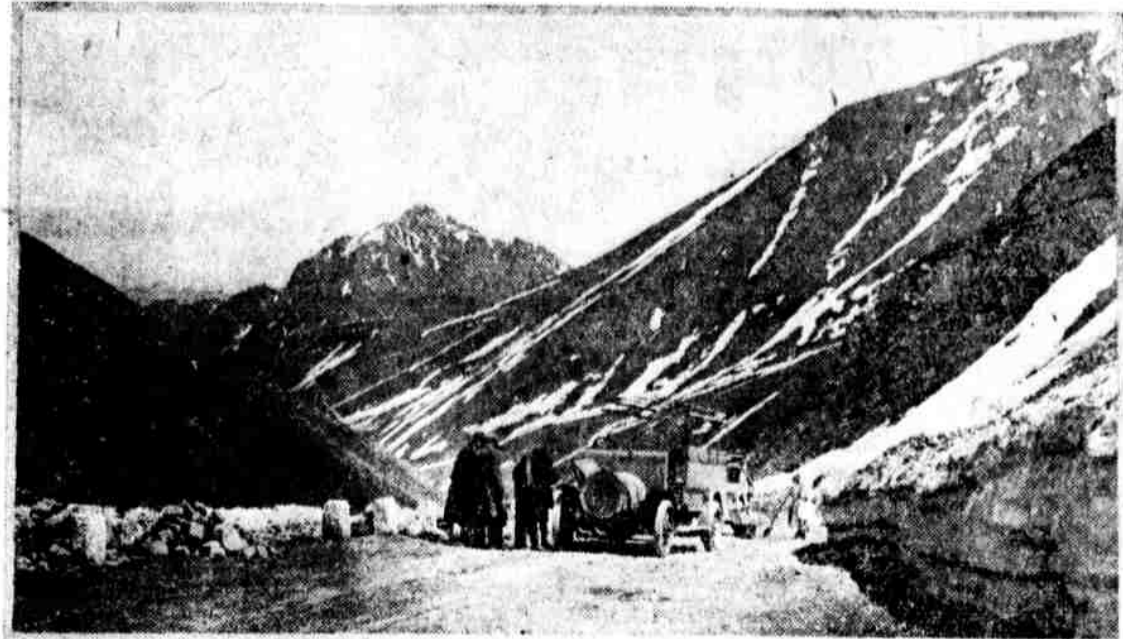
A military road in the Caucasus over which Botchkareva had to travel on her way to meet General Kornilov.

Hears Herself Discussed as a Dangerous Adherent of the Old Regime, Who Would Be Promptly Shot Without Trial if Caught