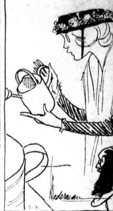
The young lady across the way says she never can remember whether it's William Allen White or James Lane Allen that's governor of Kansas now.