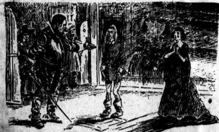
—From the Passing Show. Actor-Manager—Look here, you booby—put some life into the part. Super (even more phantasmic than before)—My lord, the duke is wounded. Actor-Manager—No, no, no, you ass! What you've got to suggest is that he must be scraped off the back wheel of a motor-bus!