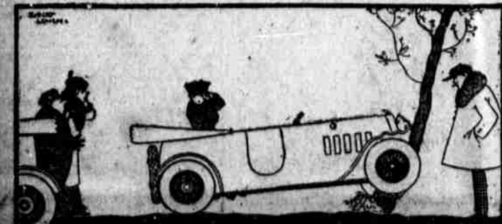
—Lesson in St. Louis Post-Dispatch. "What happened?" "My absent-minded husband forgot for the moment that he was no longer driving a tank."