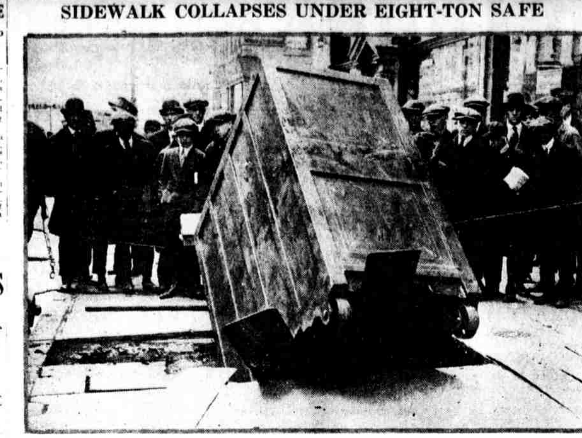
This safe wheeled across the pavement at 808 Chestnut street this morning caused the sidewalk to collapse under the weight