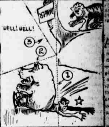
Well, well! Cut out the picture on all four sides. Then carefully fold dotted line 1 its entire length. Then dotted line 2, and so on. Fold each section underneath, accurately. When completed turn over and you'll find a surprising result. Save the pictures.

Laziness Mrs. Muggins—My husband is too tender-hearted to whip the children. Mrs. Buggins—Humph! My husband is so tender-hearted that he can't even beat the carpet—Pearson's Weekly.