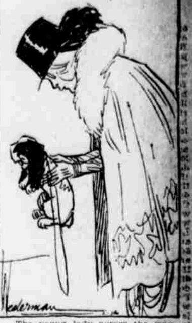
The young lady across the way says she supposes it will be some months yet before the peace terms are all fully agreed upon and the final protocol is actually signed.