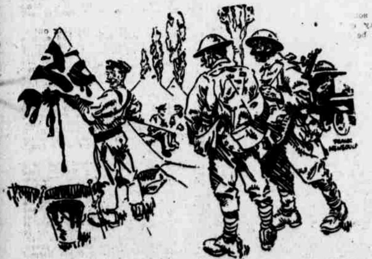
The Sketch. "Blimey, Alf: 'ere's annuver o' them erfictal war artists."