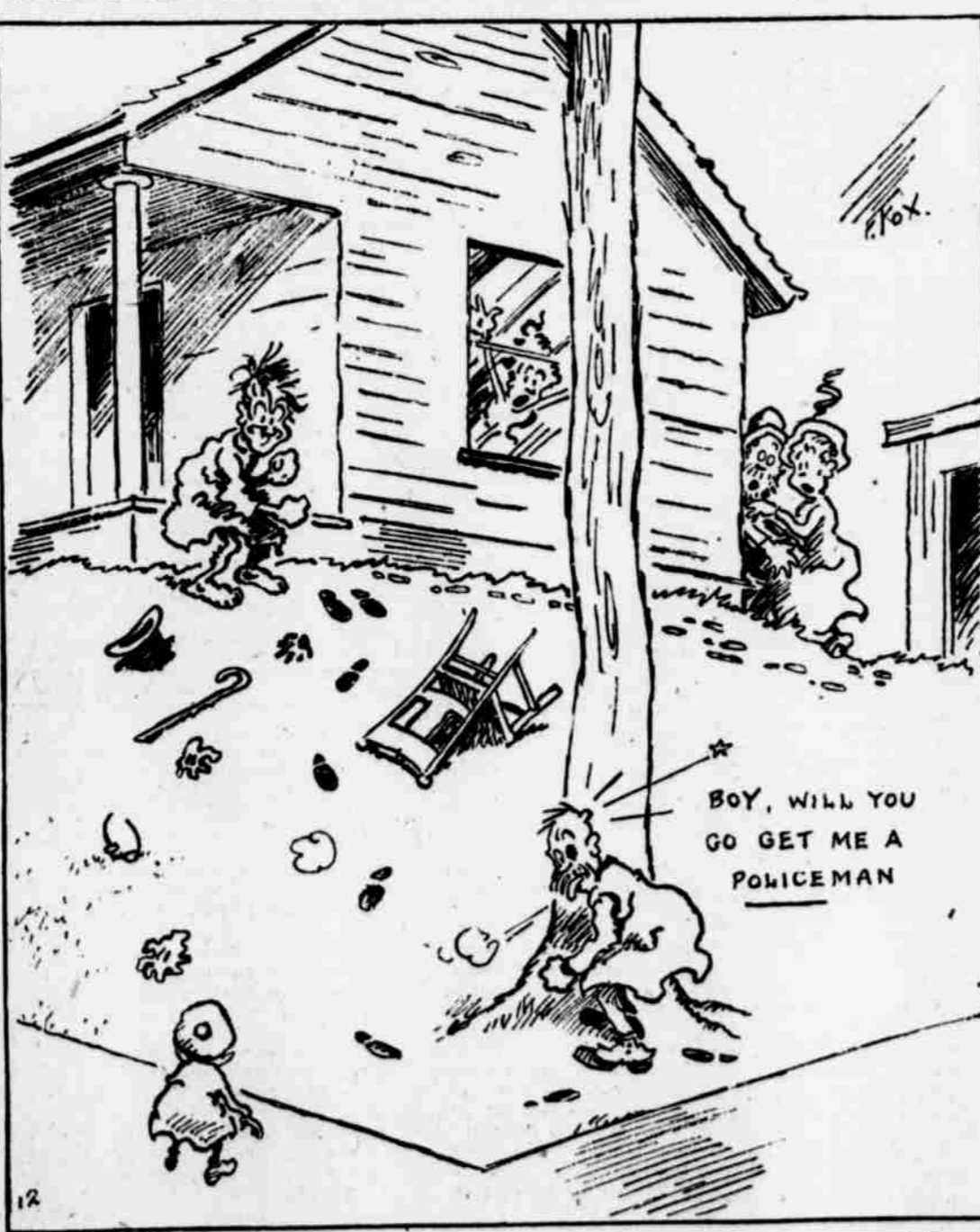
BOY, WILL YOU GO GET ME A POLICEMAN