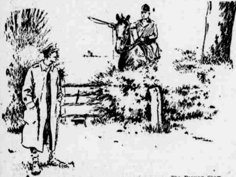
The Passing Show. Whip (to Cockney Tommy)—My good fellow, do keep out of the way. The fox may break cover just where you're standing. Cockney Tommy (calmly)—Well, wot if 'e does? I ain't afraid of 'im!