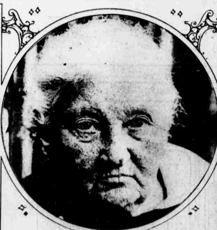
THE "LITTLE GRANDMOTHER OF THE RUSSIAN REVOLUTION," Madame Catherine Breshovskaya, is a Philadelphia visitor. She spoke before the Contemporary Club last night on "The Hope of Russia."