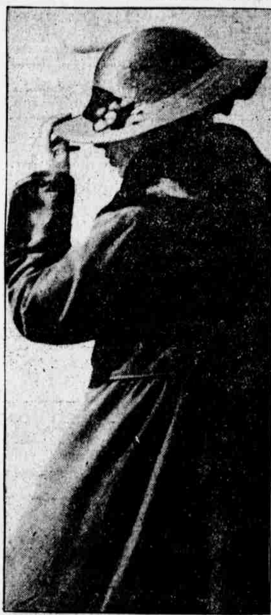
AFTER-THE-WAR spring millinery. A straw hat shaped on the lines of a Yank's trench helmet.