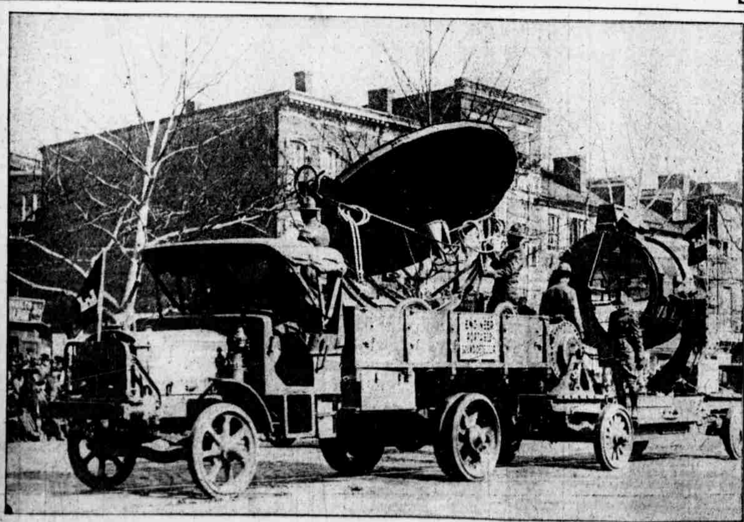
ONE OF THE FEATURES OF THE PARADE of returned veterans in Washington was this U. S. engineer portable sound detector. Its purpose is to warn of the approach of enemy airplanes.