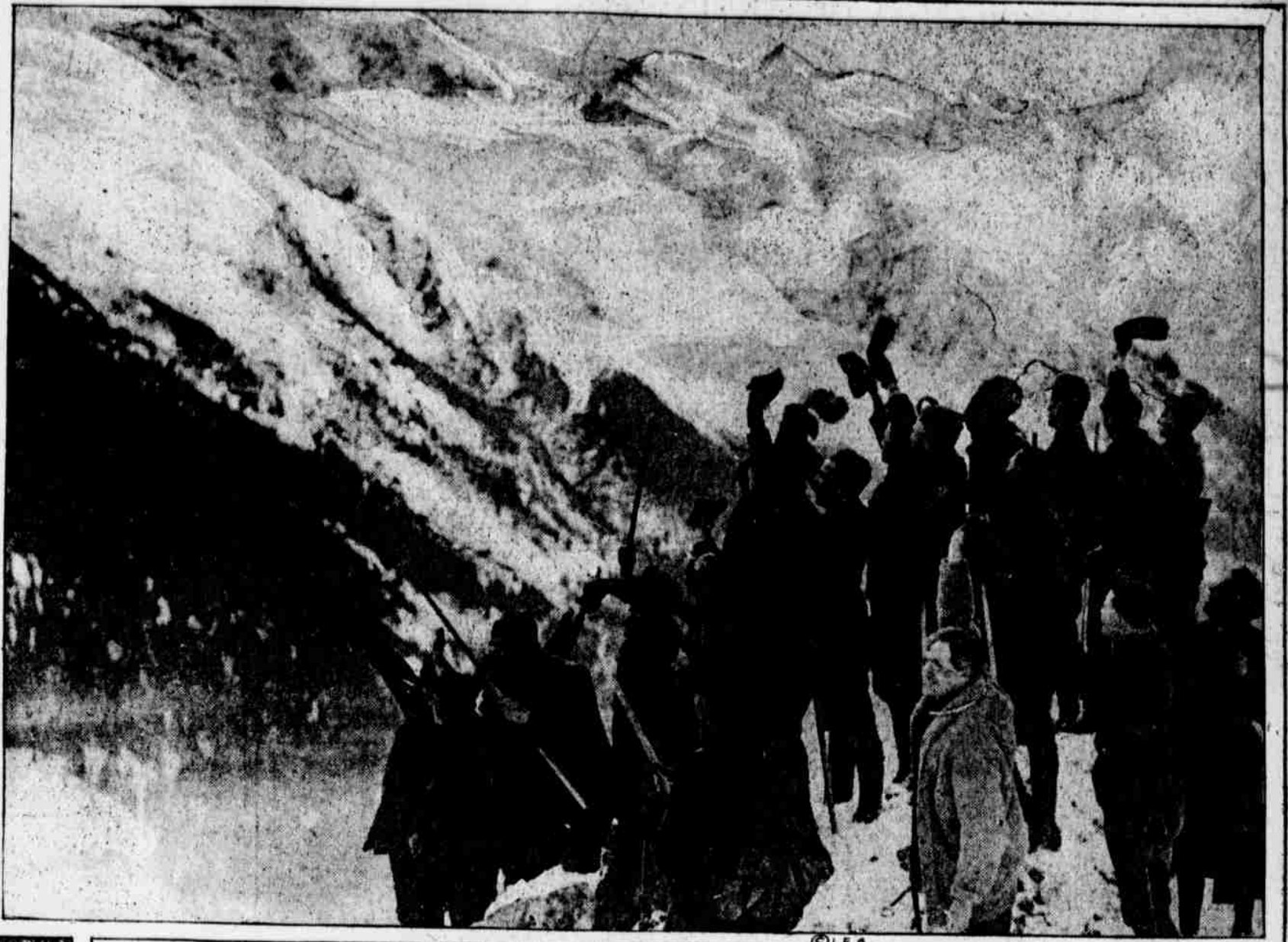
AMERICAN SOLDIERS from the top of one of the heights near Chamonix hailing Mount Wilson, one of the peaks named in honor of the President. Chamonix is one of the famous French winter resorts high in the Alps, and is now a leave center for American soldiers.