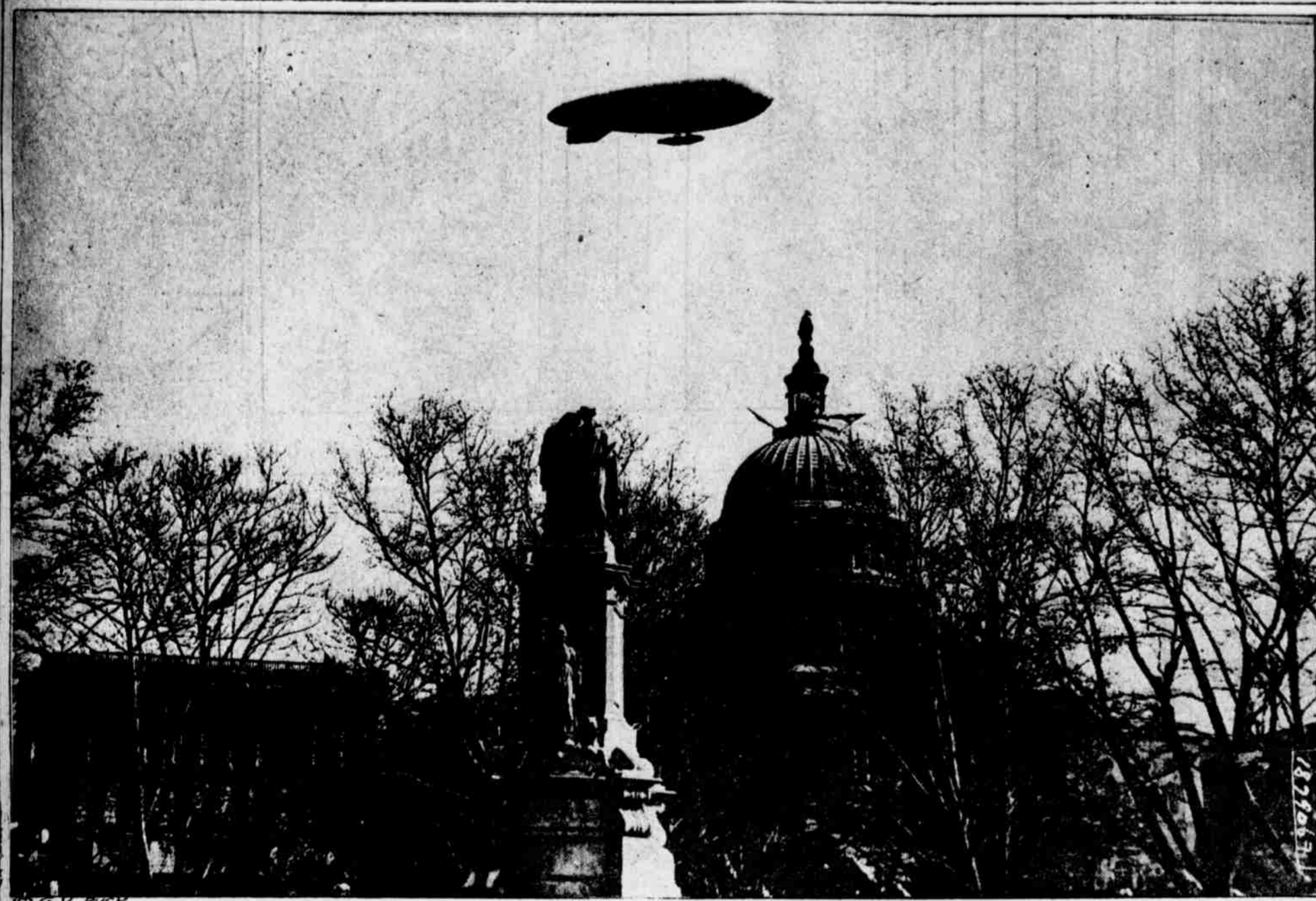
THE NAVY DIRIGIBLE C-3, which recently made a record endurance flight from the Cape May station, flying over the Capitol during Washington's parade in honor of the soldiers, marines and sailors from the District of Columbia.