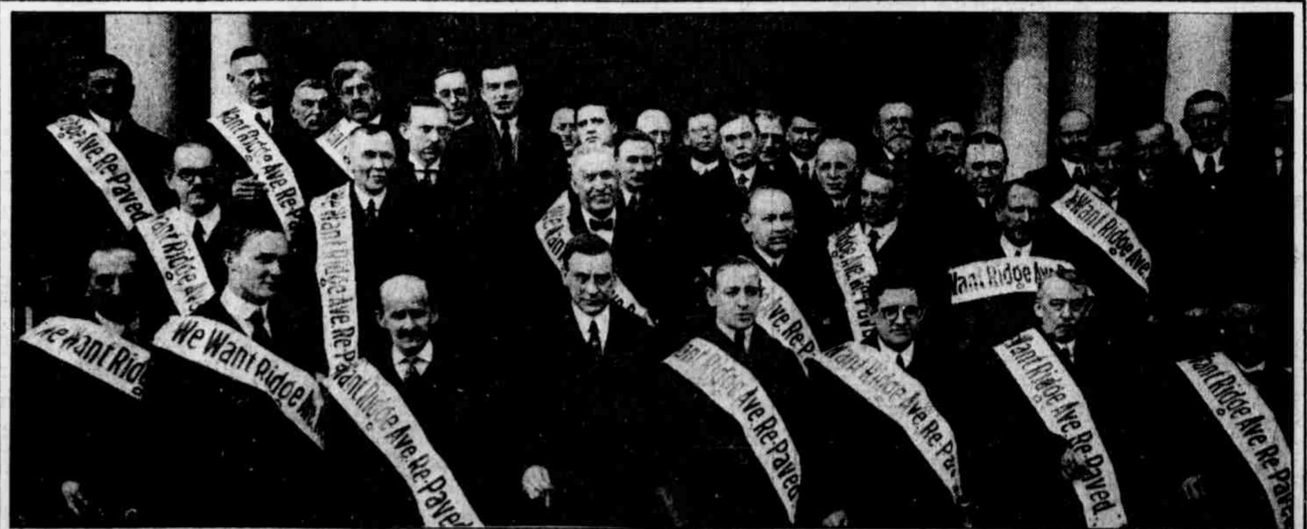
"WE WANT RIDGE AVENUE REPAVED." Members of the Twenty-first Ward Board of Trade who invited members of Councils' Highway Committee to "bump the bumps" over Ridge avenue and other Roxborough thoroughfares yesterday. The inspection trip was staged in the hope of getting road improvements made in the spring.