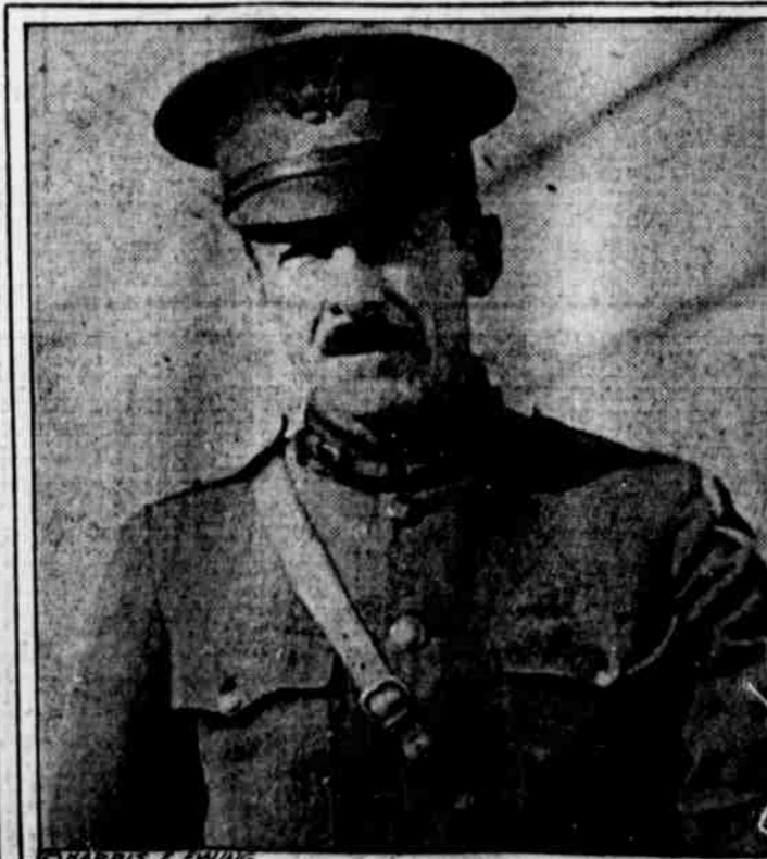
STARR'S & EVING