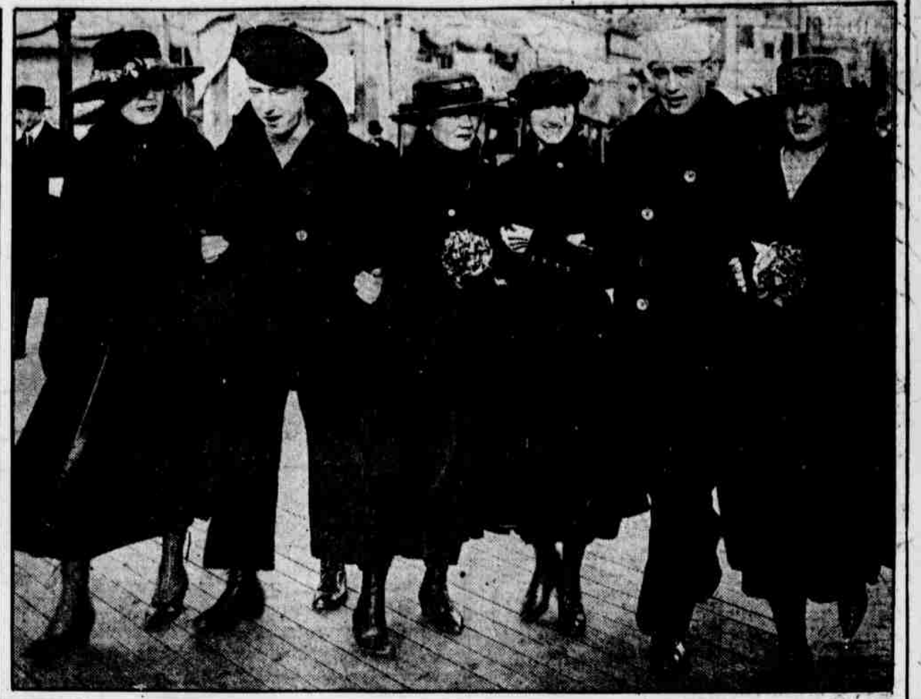
A MERRY GROUP of cool-weather patrons. Evidently the necessity of overcoats didn't chill this jolly sextette's desire for a frolic along the Boardwalk.