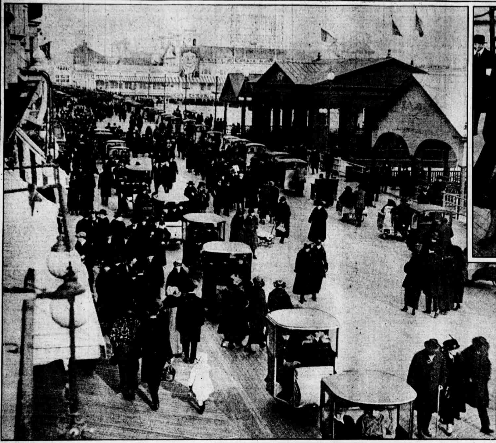
AFTER A DOUBTFUL morning, the sun of the afternoon brought many out for a promenade along the Boardwalk at Atlantic City yesterday.