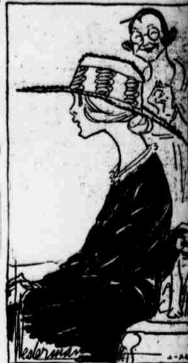
The young lady across the way says once in a while the paper makes some mention of the moron problem but as a rule we hear very little about the Philippines now.