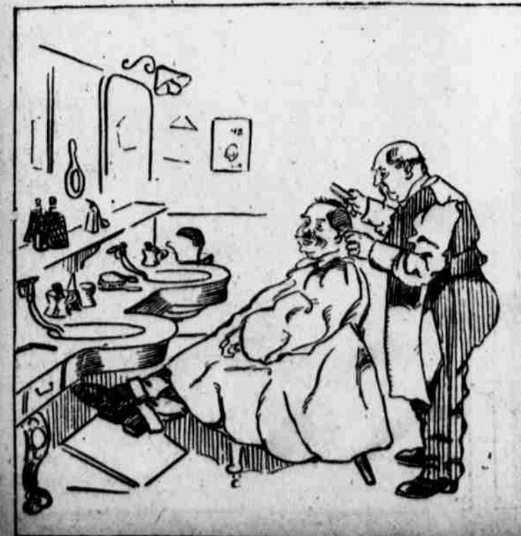
Chatty Highbrow—You, sir, they seem in a pretty mood in Germany, and I hope you'll be able to tell us if they'll come in with the