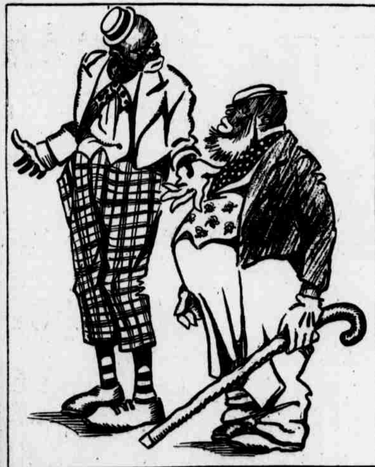
Music Hall Artist (to his partner)—We doan seem ter have no luck wid our show dese days. The Partner—An' how can you spes luck when youse go an' change your fool whiskers from blue ter green?