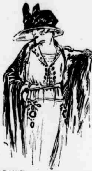
(First Floor, Central)

Some are tailored; many are braided, a few are embroidered, especially the jerseys. There are ever so many styles; the serges are mostly navy and black; the jerseys old blue, henna, taupe, navy and black. All sizes are in the lot.