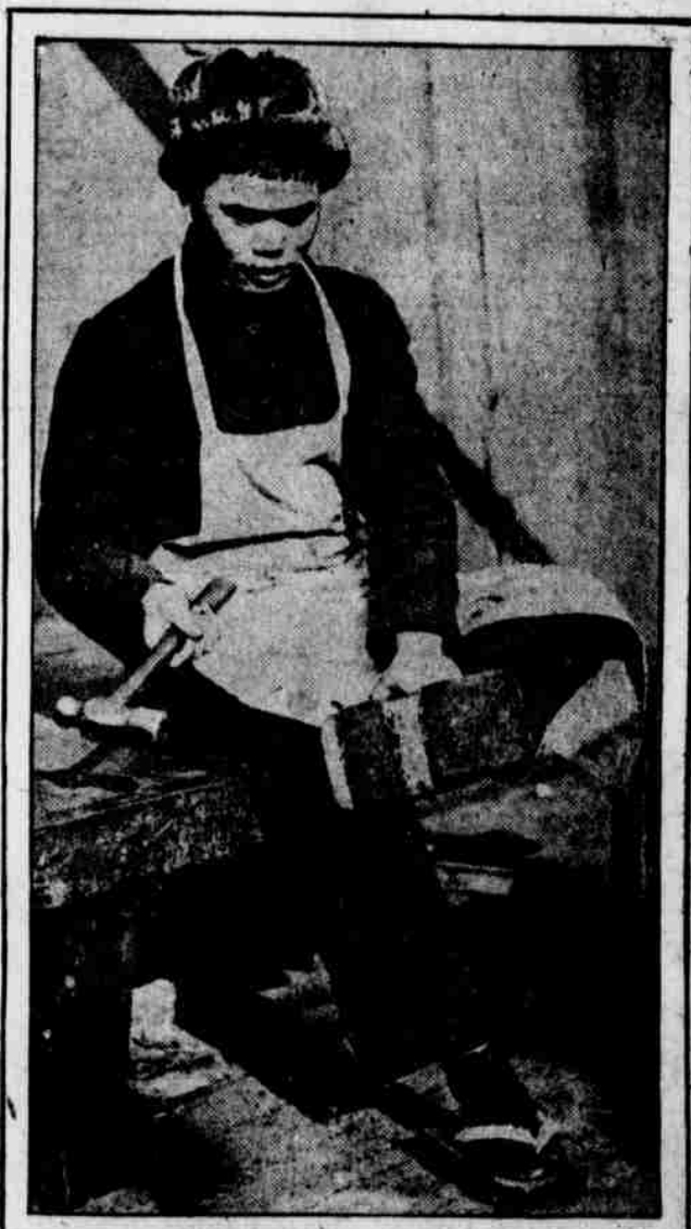
THE FAR EAST COBBLER of the Japanese transport Malay Maru, at the Reed street wharf, adds a few finishing taps to the all-sole Nipponese footwear.