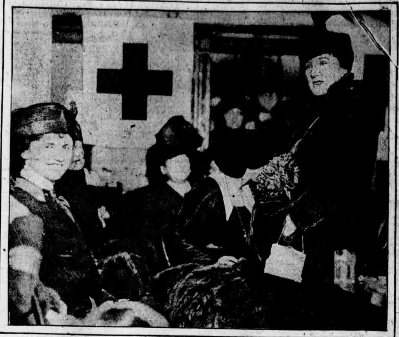
MARY ROBERTS RINEHART, famous novelist, recently returned from France, addressing the members of Independence Square Auxiliary of the Red Cross, at 608 Chestnut street. In an interview Mrs. Rinehart said that conditions at Brest are "halfway between unbearable and very good"