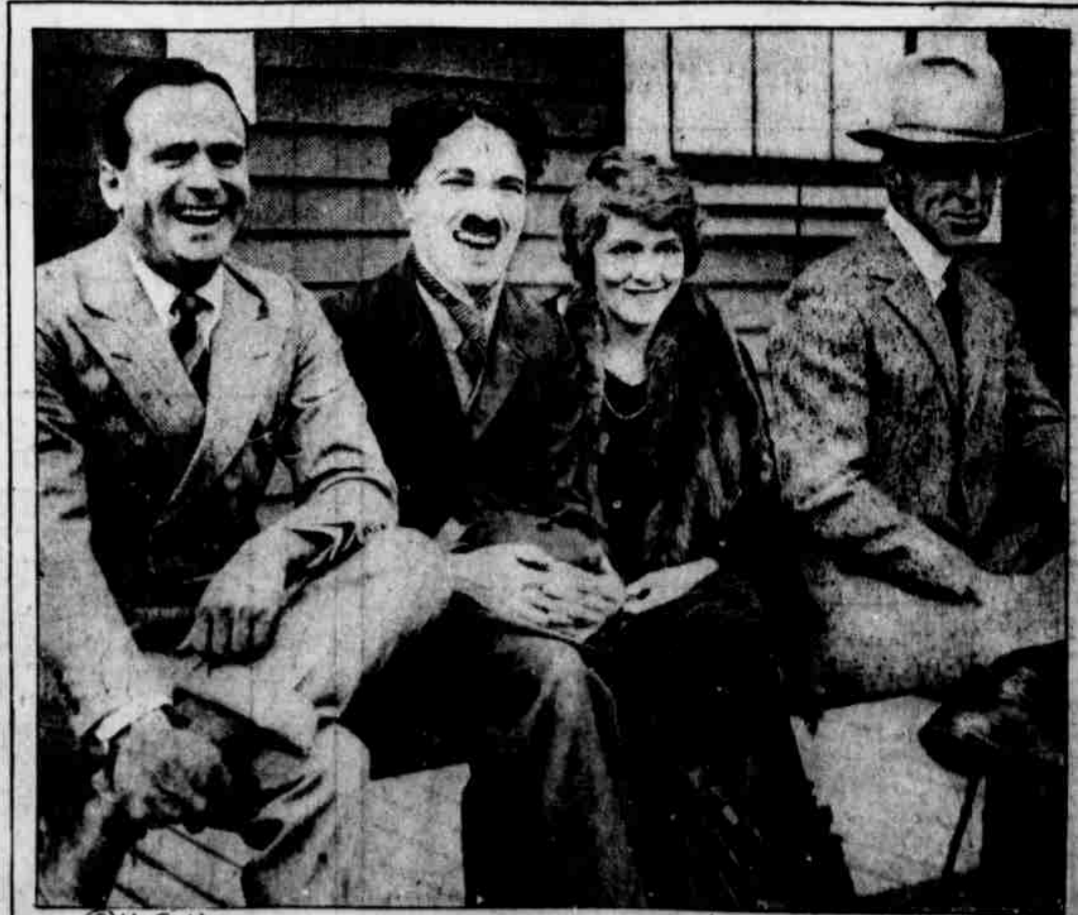
FROM LEFT TO RIGHT are "Doug" Fairbanks, Charlie Chaplin, Mary Pickford and D. W. Griffith. The three film performers and the photoplay director have just formed a motion picture corporation.