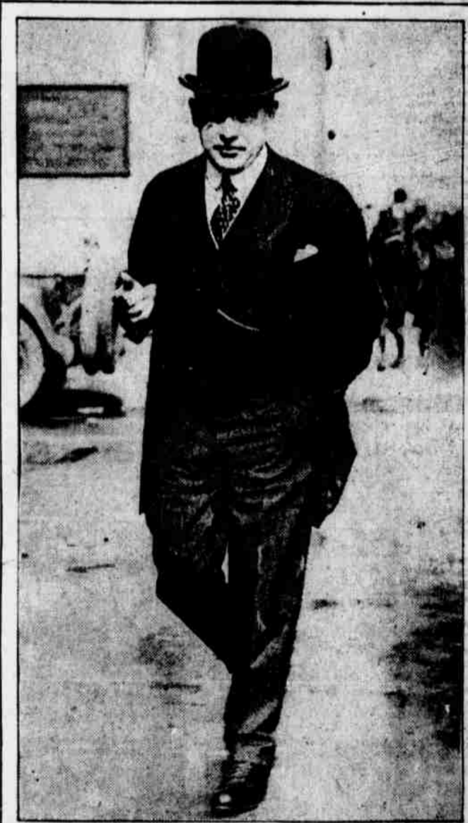
GOVERNOR WALTER E. EDGE, of New Jersey, in town to talk over Philadelphia-Camden bridge legislation.