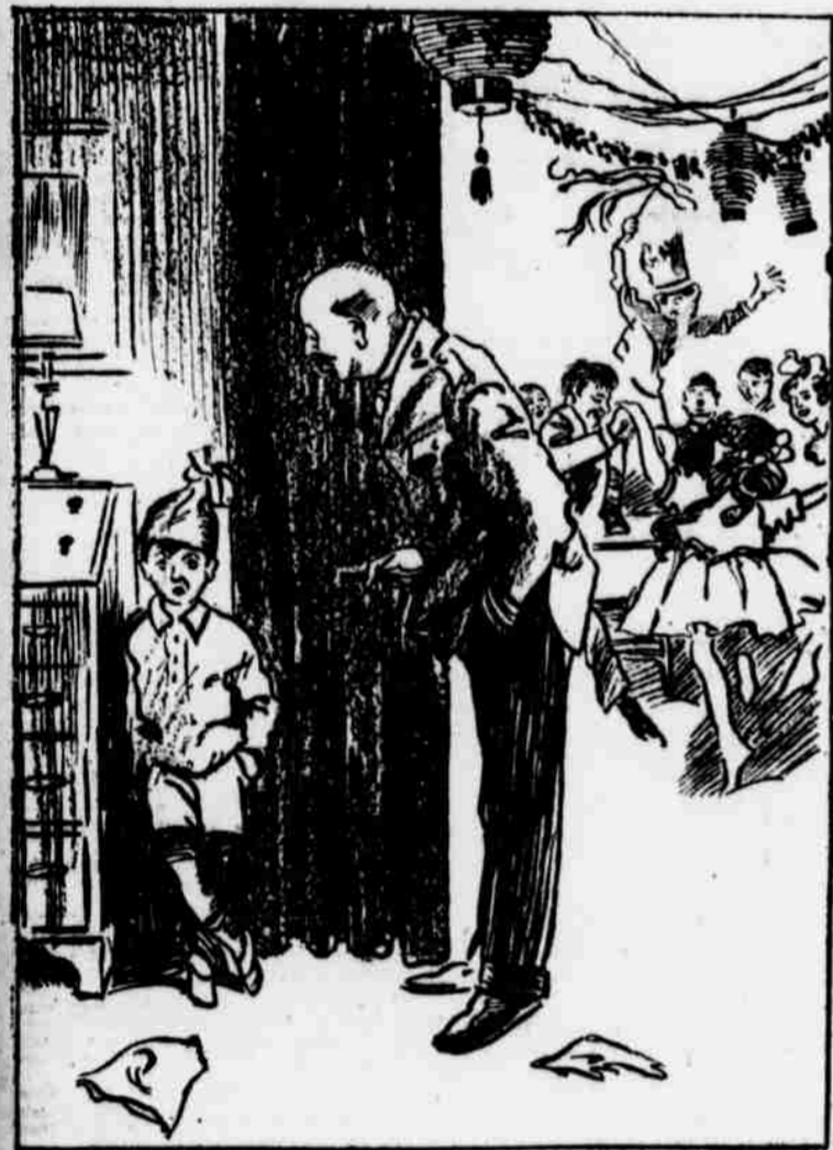
—The Bystander. Father (to young host)—Hullo! What's the meaning of this? Son—Huh? Anybody would think it was their party the way they are enjoying themselves!