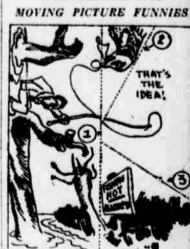
Cut out the picture on all four sides. Then carefully fold dotted line 1 its entire length. Then dotted line 2, and so on. Fold each section underneath, accurately. When completed turn over and you'll find a surprising result. Save the pictures.

News to Him Sam—Ah done heard dat dey fin' Columbus's bones. Kara—Lawd! Ah nevah knew dat he wuz a gamblin' man—Panther.