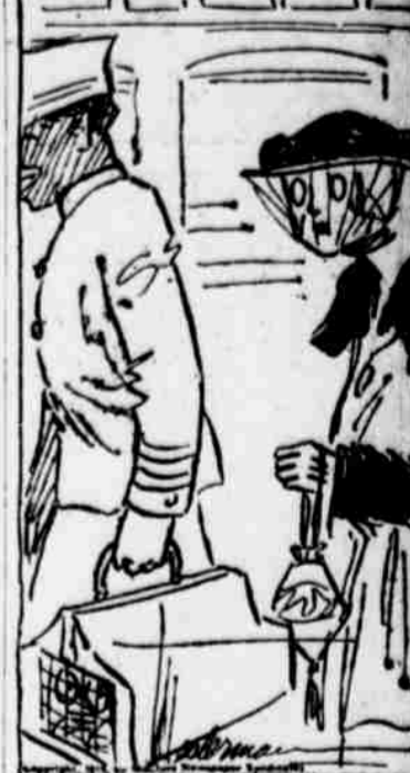
The young lady across the way says the soldiers get used to anything, but personally she knows she'd never close her eyes all night if she had to sleep on a post.