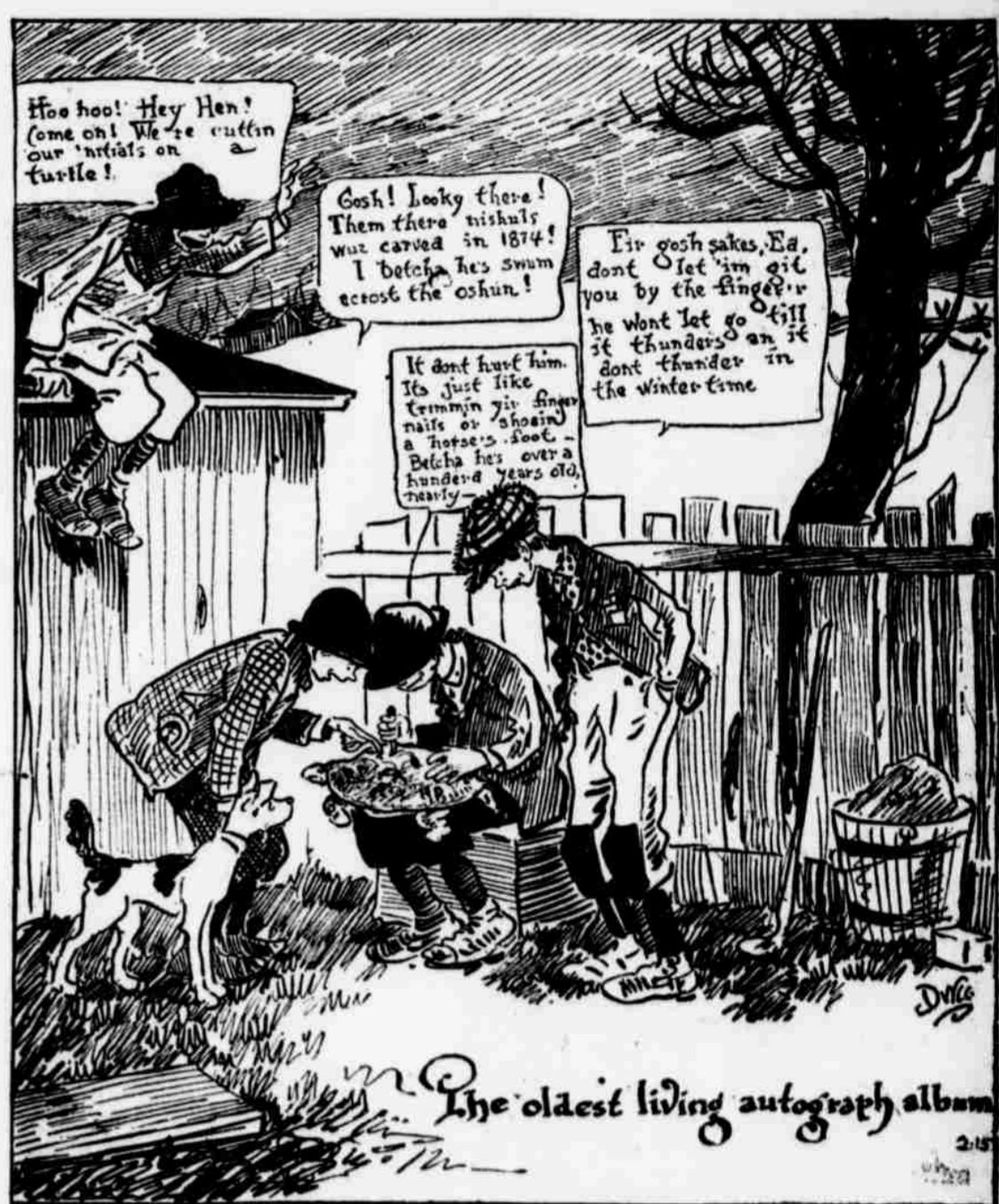
The oldest living autograph album