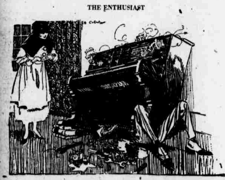
The Passing Show. "John, darling, now the petrol restrictions are off, don't you think you might stop tinkering with the piano and give the old car a turn?"