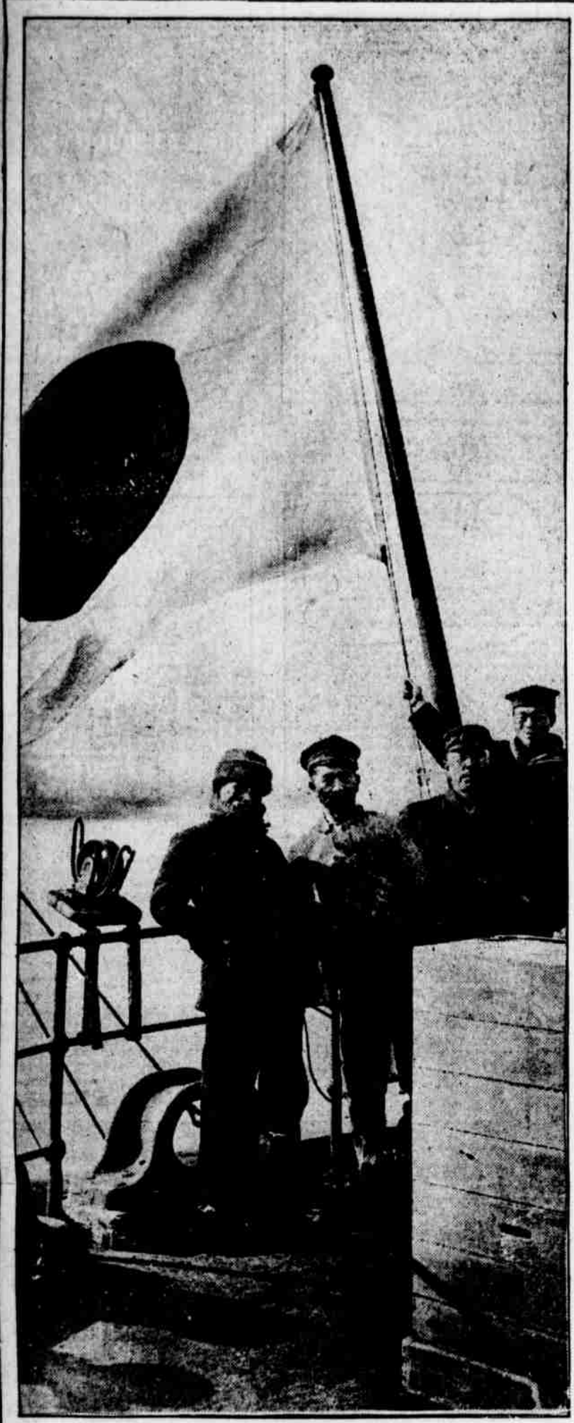
THE JAPANESE STEAMSHIP Malay Maru, in transport service since September, is docked at the Reed street wharf. Flying from the ship's staff is the merchant flag of Japan.