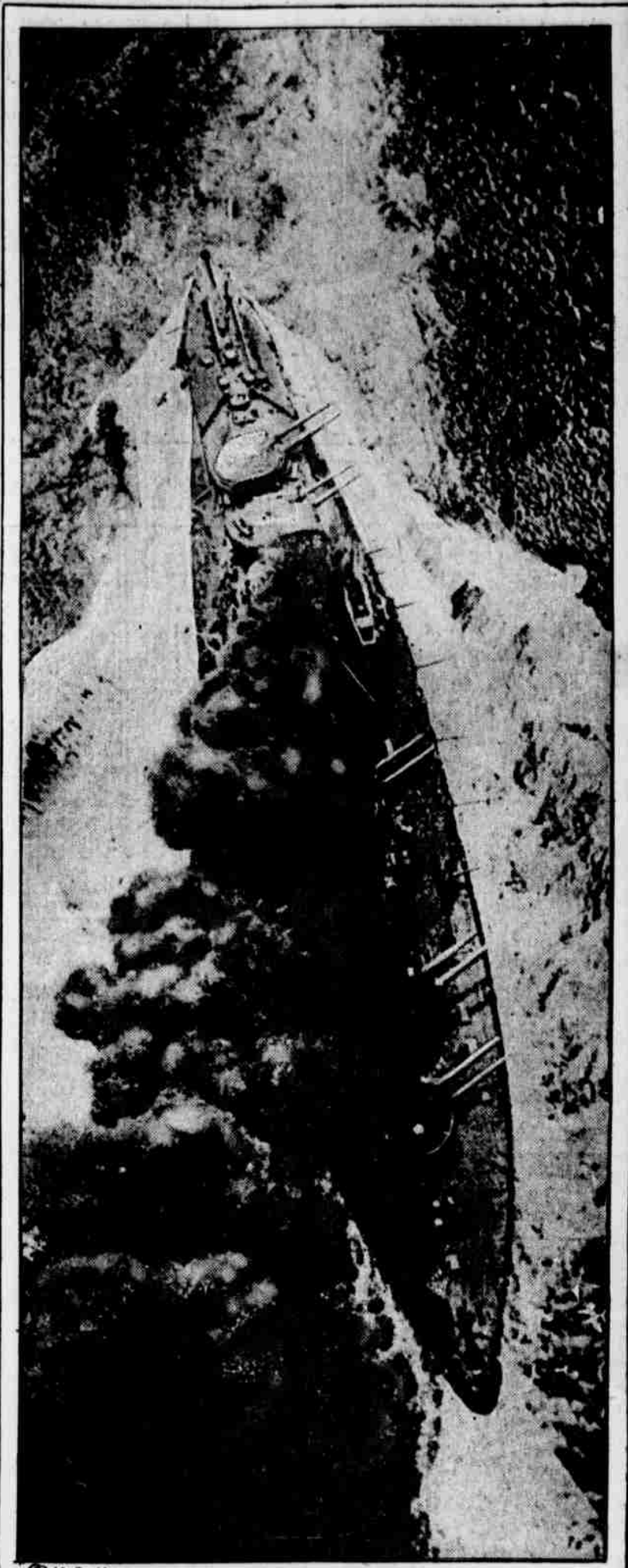
THE BRITISH WARSHIP ERIN sending off a "smoke screen." This photograph was made at sea from a kite balloon.