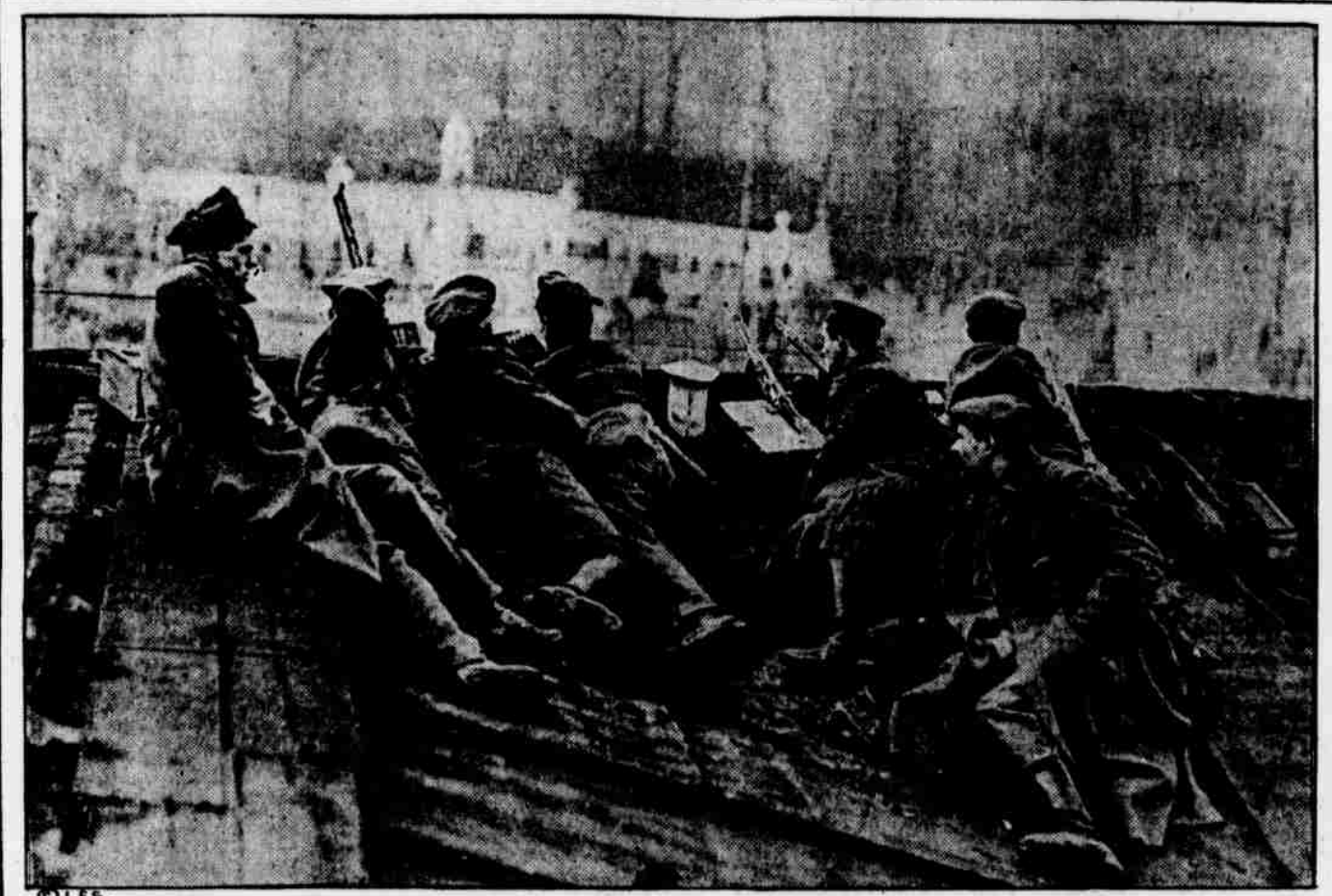
LOYAL EBERT TROOPS from the top of one of the prominent government buildings in Berlin training their guns on the rebellious Reds.