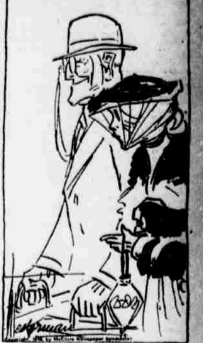
The young lady across the way says the German wine about our use of a shotgun is all the more absurd because it wasn't even a whole shotgun, but merely a sawedoff one.