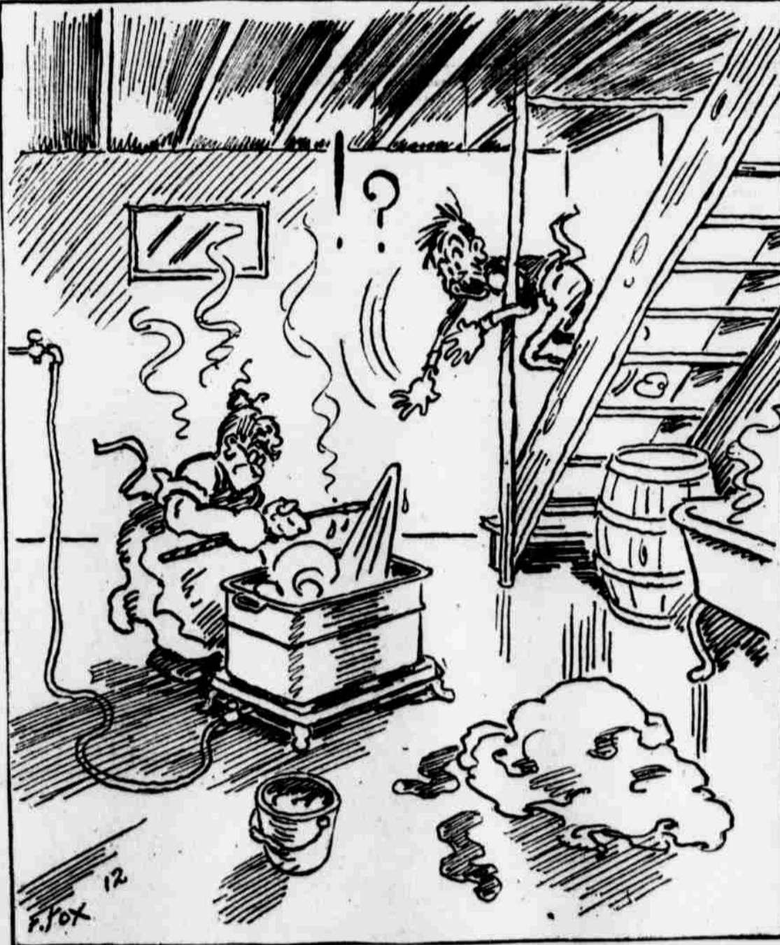
F. FOX '19