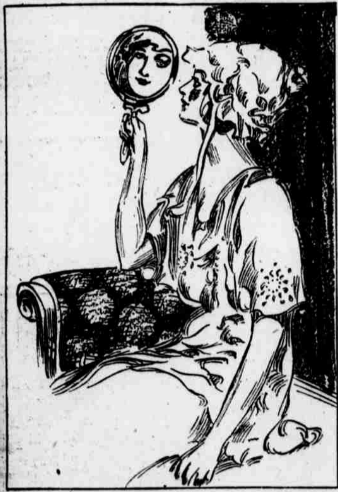
The Passing Show

DAD THOUGHT HE HAD LOST THE BEST LITTLE GOLF PUTTER IN THE WORLD—BUT, NO, THE NEW WASHERWOMAN HAD IT