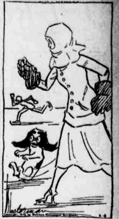
The young lady across the way says her father always leaves his cigars lying around where they dry out and she believes she'll get him a thermostat for Christmas.