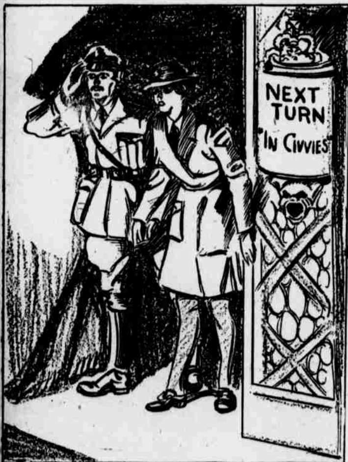
—The Passing Show.