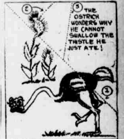
Cut out the picture on all four sides. Then carefully fold dotted line 1 its entire length. Then dotted line 2, and so on. Fold each section underneath, accurately. When completed turn over and you'll find a surprising result. Save the pictures.

Perseverance "H'm! I thought you said you never borrowed from your friends?" "I don't, old chap. But I'm not disheartened. I still go on trying." —Passing Show.