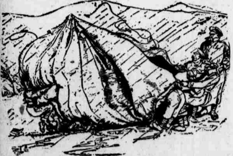
London Opinton. Sergeant (after an hour's heroic efforts to set the tent back on the perpendicular)—'I said "Push!" you couple of pudden-heads—not "Pull!"'