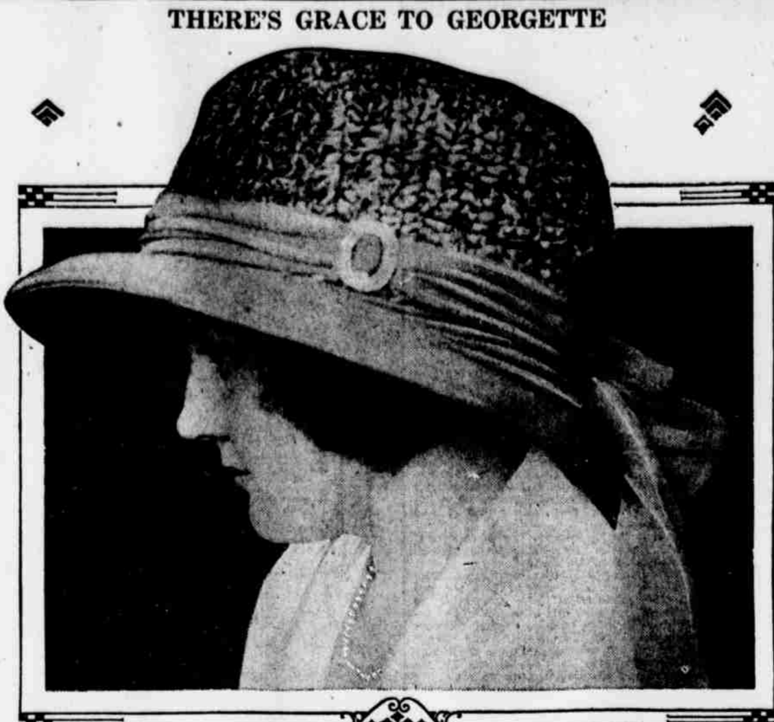
Her first bonnet for the spring is apt to express a girl's personality, so fervently has she been longing for it. There are dreams and all sorts of things in the make-up of this hat—a smart chip shape for perkiness, a brim and whimsical little streamer of georgette for grace and a clever pearl buckle just for instance.

Games for St. Valentine's Night... To the Editor of Woman's Page: Dear Madam—Will you kindly publish in your column some suggestions for novel games for St. Valentine's night?