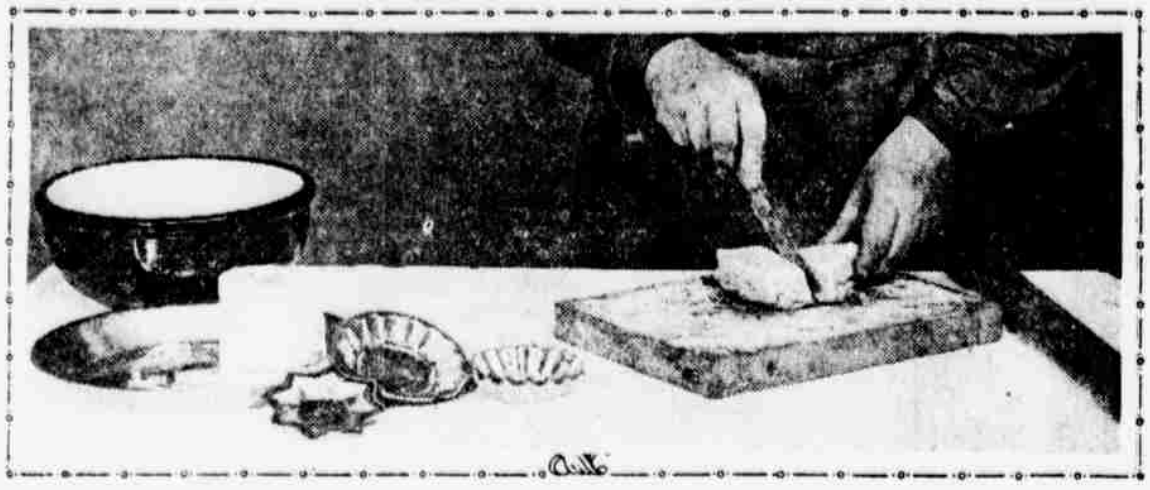
Cutting, trimming and folding the dough is an important step in the art of making good, flaky pastry