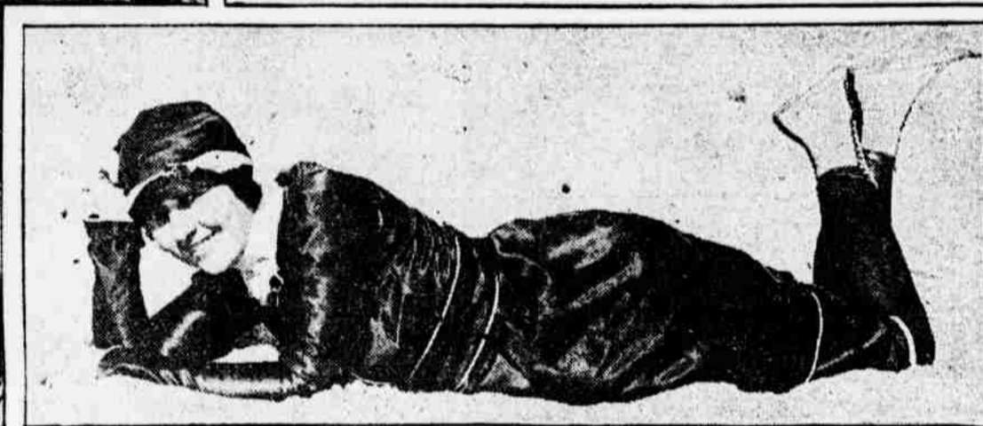
HEROINE OF A HUNDRED HAIR-BREADTH (FILM) ESCAPES—Miss Pearl White on the strand at Palm Beach, Florida.