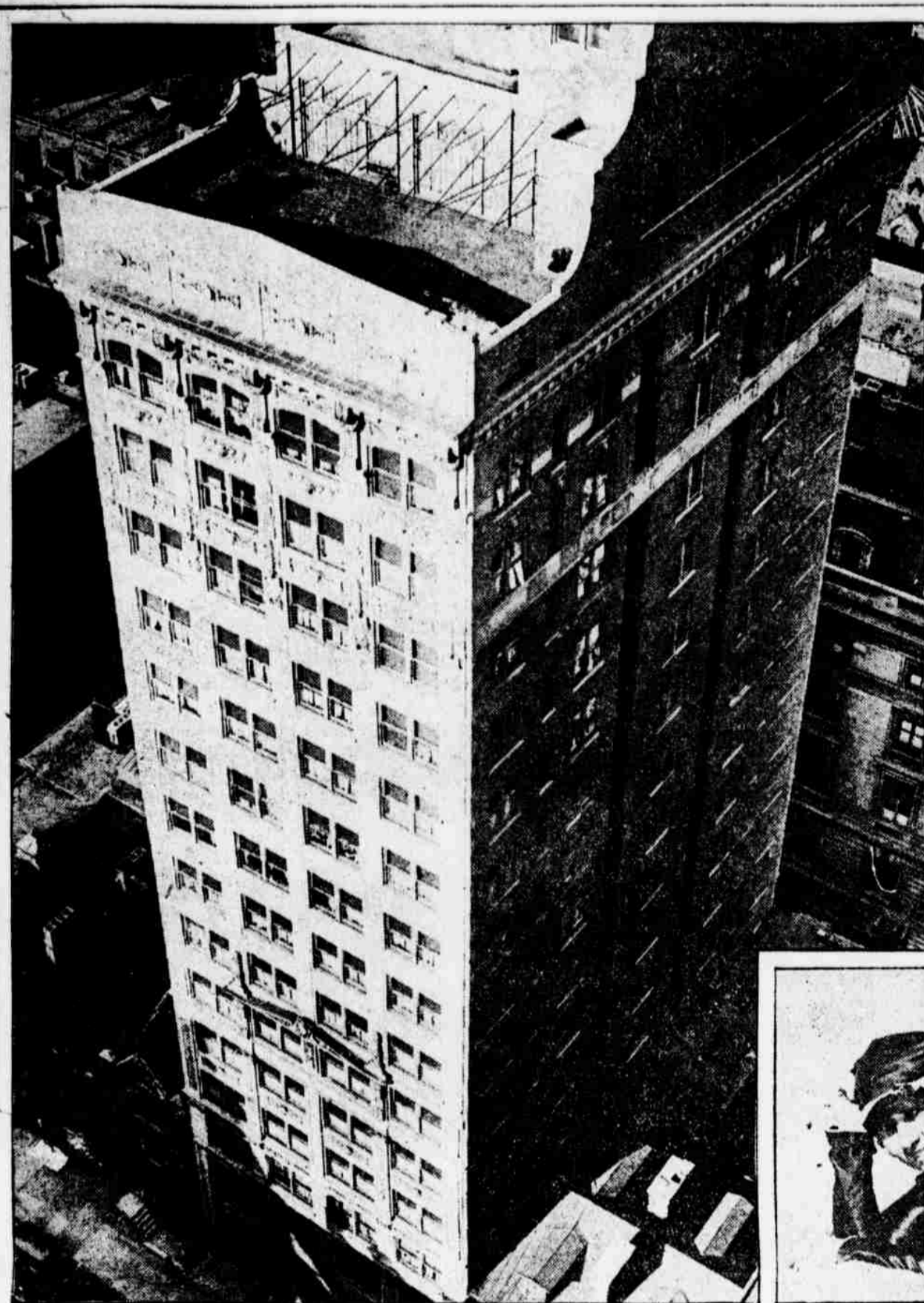
HOW AN AVIATOR SEES IT. A view from above of Fifteenth and Walnut streets. The large white building is the Longacre Apartments.