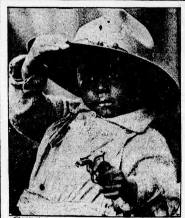
THIS PATRIOTIC LITTLE COLORED CHAP is saluting some of his colored brothers returned from abroad and now on the way to the demobilization camp.