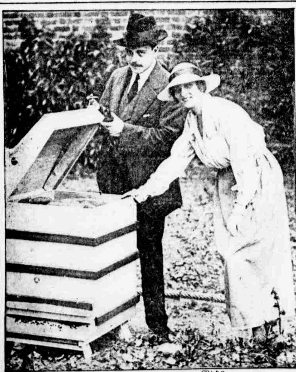
EX-KING MANUEL, so London reports, is ready to go back to Portugal if his country wishes him to return. In the meantime, Manuel and his wife, a distant cousin of the former Kaiser, are devoting most of their time in England to farming.