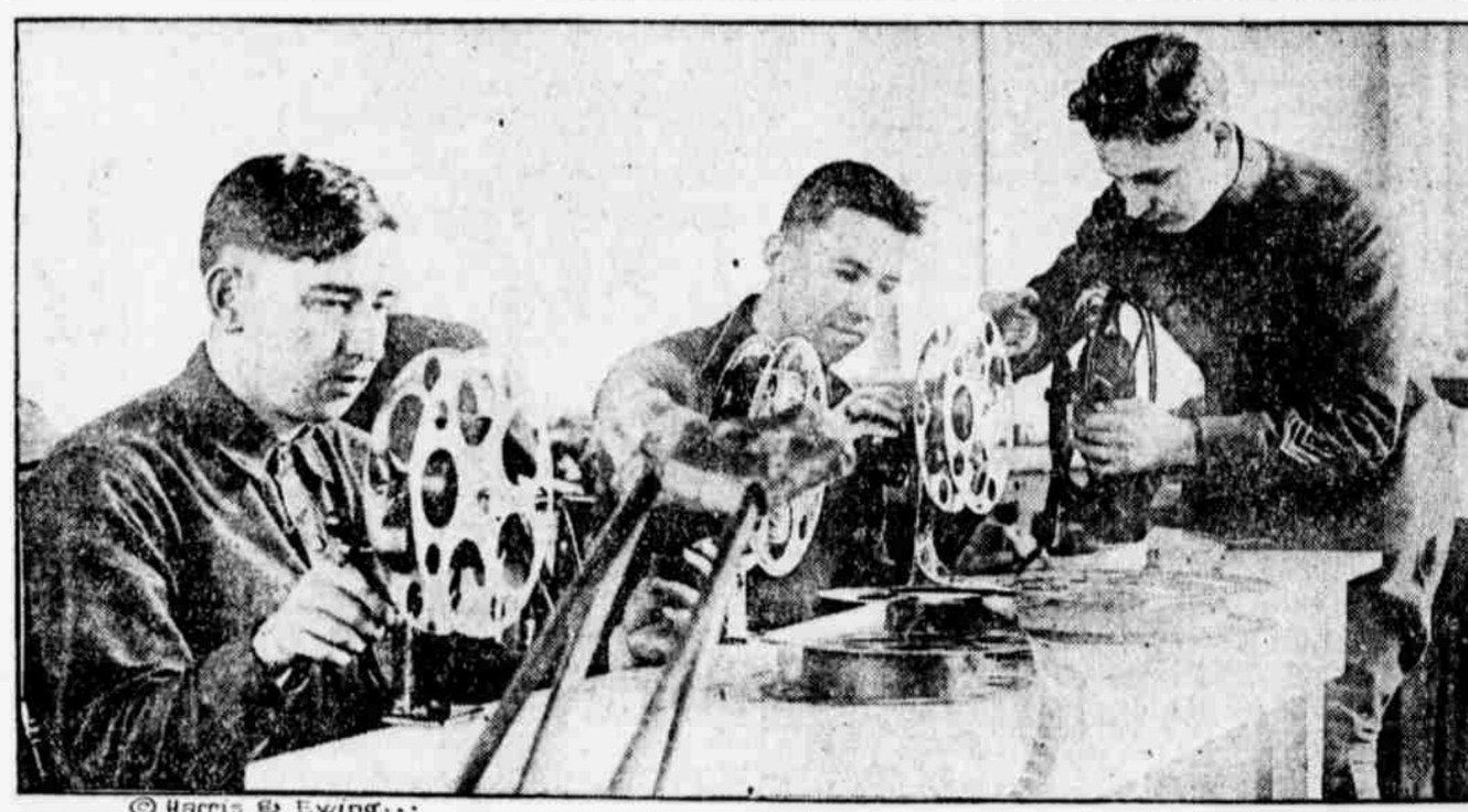
MANY WOUNDED SOLDIERS will operate motion picture projectors as soon as they are freed from the hospitals. Training in the operation of these machines is a part of the curative activities for patients in the Walter Reed Hospital, Washington