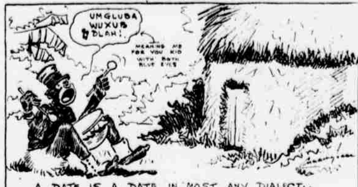
A DATE IS A DATE IN MOST ANY DIALECT.

THE old-fashioned green plush album that formerly reposed on the marble-topped table is no more. It was slipped the rollers when fashion discarded the parlor for a living room. But the fluttering fluff brought forth an armful of snapshots. With the aid of a manicured fingernail, among the blurs, familiar faces could be discovered. Among those was a large football group photo and all the members were local heroes of