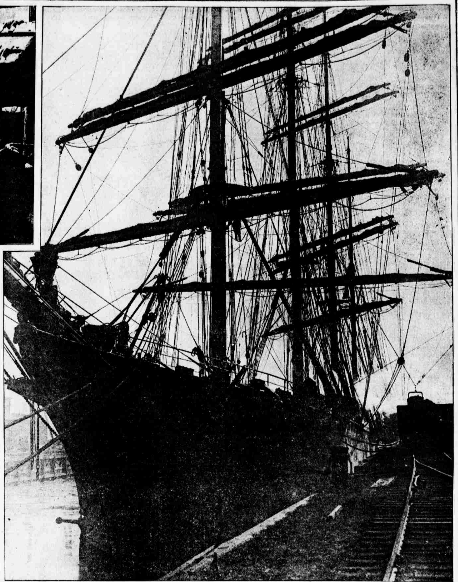
THIS FINE FRENCH BARK, THE VALPARAISO, in the silhouette of the setting sun, arrived in the port of Philadelphia via Bahia on Tuesday with many tons of manganese ore as cargo.