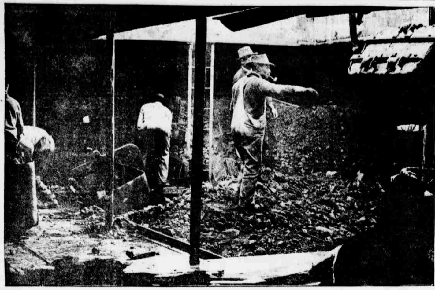
UNLOADING MANGANESE ORE from the hold of the bark Valparaiso, just in from South America, at her pier in Port Richmond, Philadelphia.