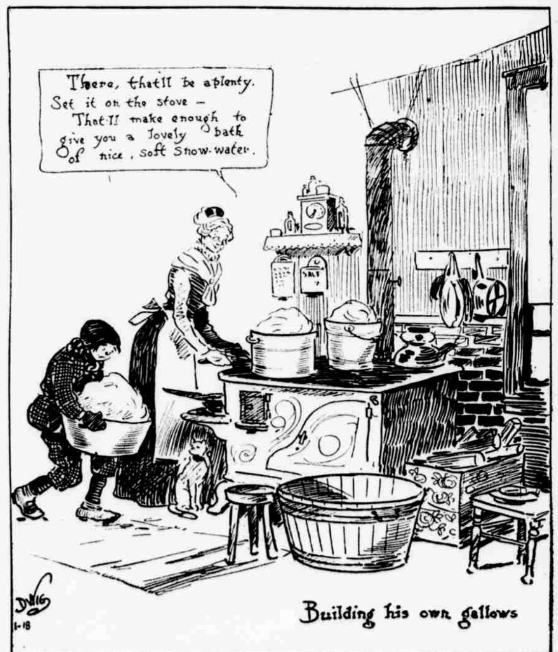
Building his own gallows