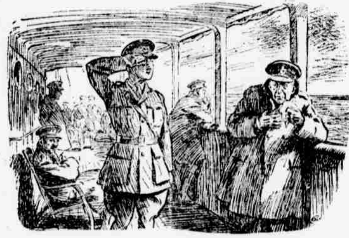
General (as junior sub salutes): "Go to the devil!"