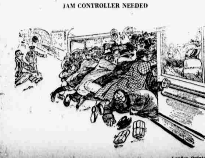
Subway every evening from 5 to 7. —London Opinion.