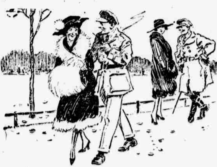
The girl in the Background—I can't understand Billy walking that out—she's forty if she's a day. The Officer—Oh, he's on a good thing. That's how he gets his matches—he's in a tobacconist's shop.