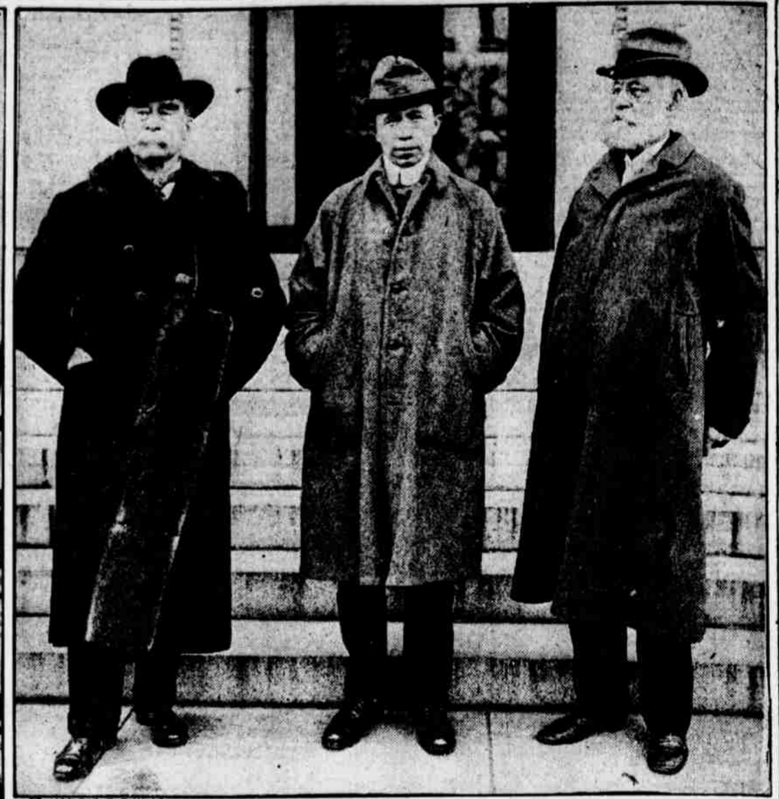
POLAR STARS. At the left is Admiral Robert E. Peary, in the center is Vilhjalmur Stefansson, and at the right Major General A. W. Greely. Stefansson has just received the Hubbard gold medal, an award by the National Geographic Society, in the presence of other famous explorers and many scientists