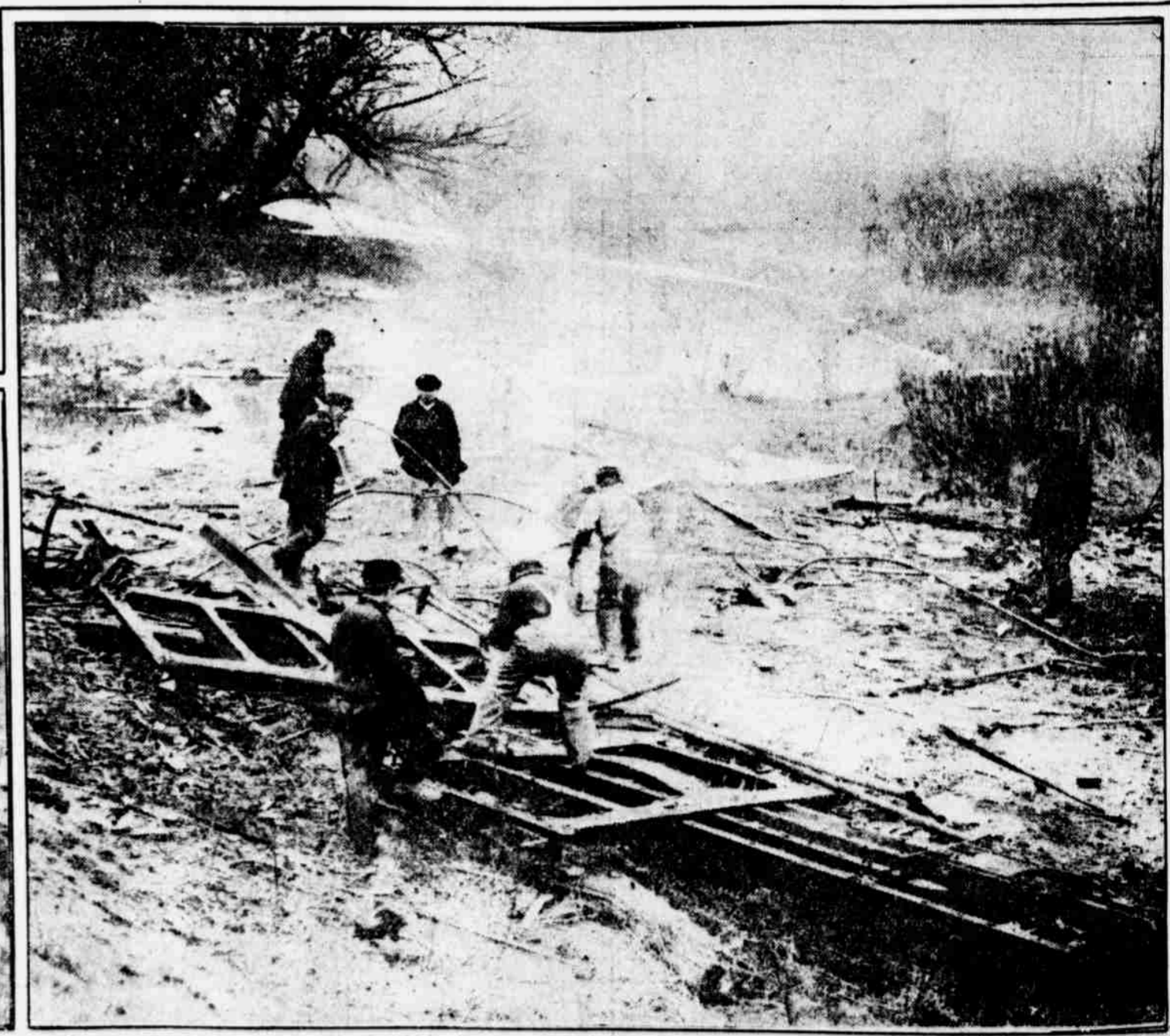
WRECKING CREWS DESTROYING THE DEBRIS OF THE SCRANTON FLIER'S CRASH into the rear of the Doylestown local train. After the dead and injured had been removed, railway employes worked all night carrying the wreckage to the ravine near the track, where it was burned.