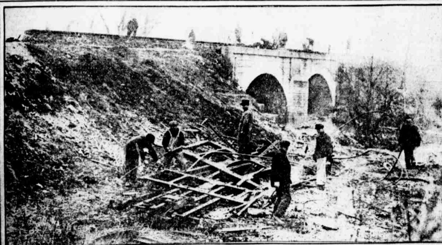
SCENE OF LAST EVENING'S WRECK ON THE PHILADELPHIA AND READING RAILWAY'S BETHLEHEM BRANCH near Fort Washington in which eleven persons were killed and thirty more or less seriously injured. The accident occurred on the railway embankment at top of view. In the ravine below railway employes are burning the wreckage.