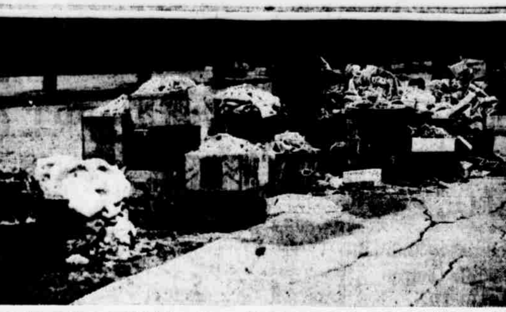
As a result of the failure to collect ashes yesterday and a week ago yesterday in Holly street, West Philadelphia, from West-miner avenue to Pennrose street, there is a famine in ash receptacles, the streets of the section are in a wretched condition and many carpets ruined because of the tracking of coal ashes into homes.