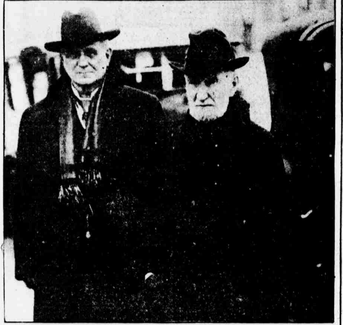
SPEAKER CHAMP CLARK, of the House of Representatives, on the left, and Congressman Joseph Cannon.