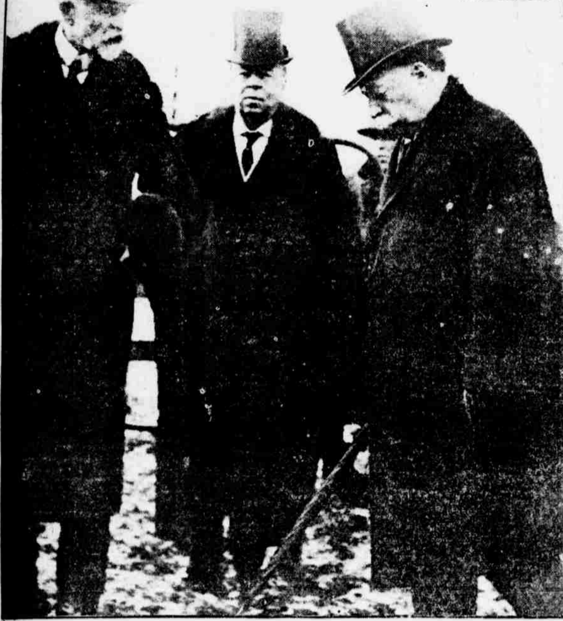
(Left to right) SENATOR HENRY CABOT LODGE, Senator George E. Chamberlain and former President William Howard Taft.