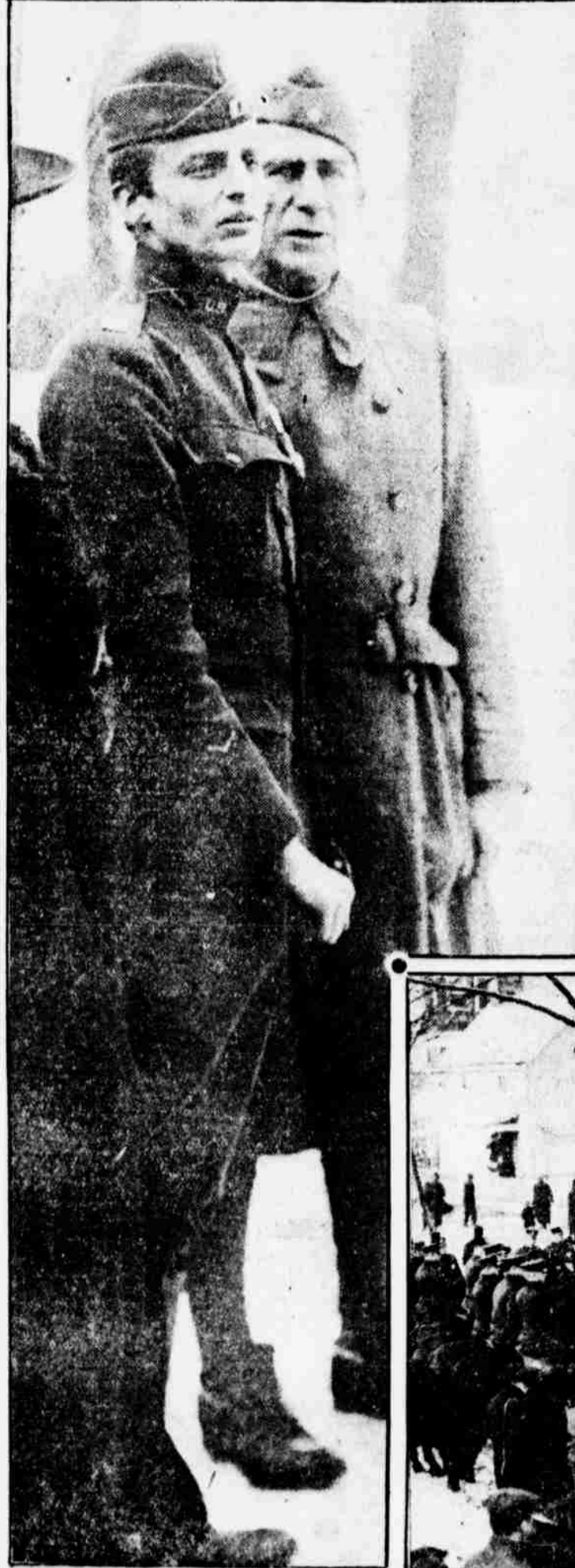
CAPTAIN ARCHIE ROOSEVELT, the only Roosevelt son at the funeral (at left).