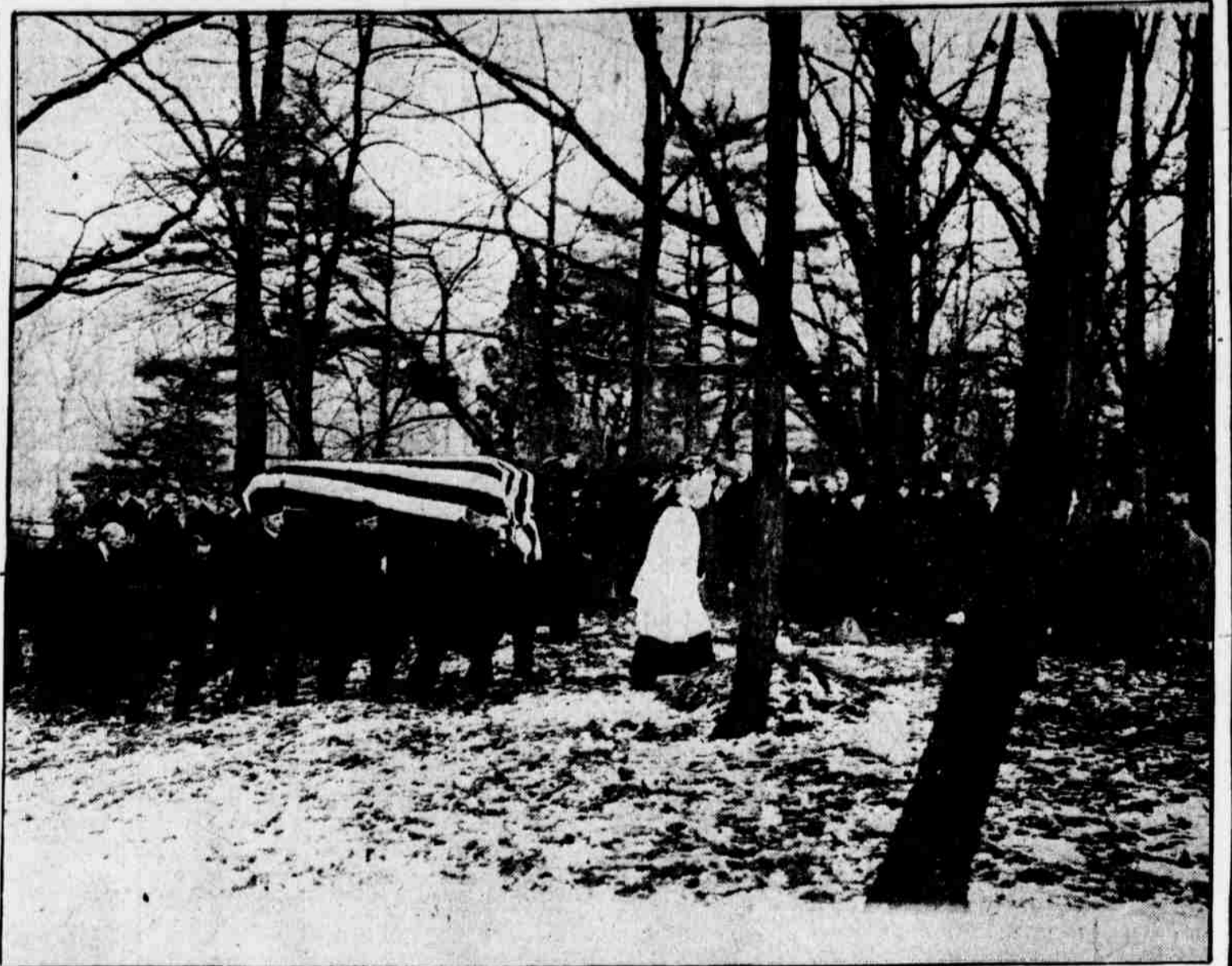
THE FLAG-DRAPED CASSET containing the body of Colonel Roosevelt being carried into Christ Church at Oyster Bay.