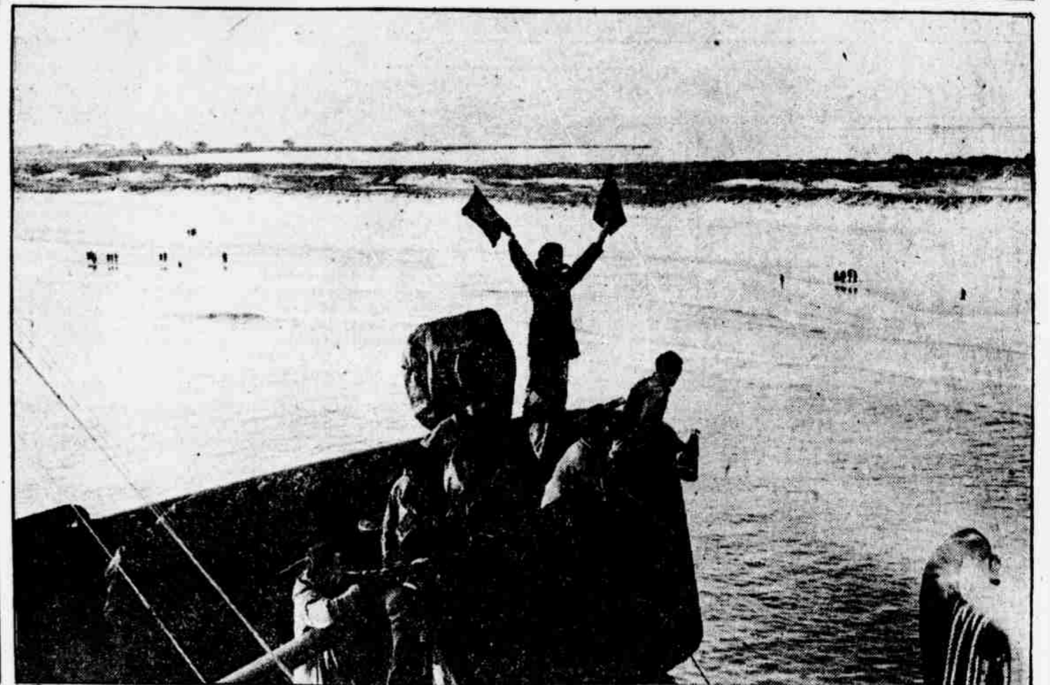
WAVING MESSAGES to the shore from the stranded transport Northern Pacific, aground on a sandbar off Fire Island, N. Y.