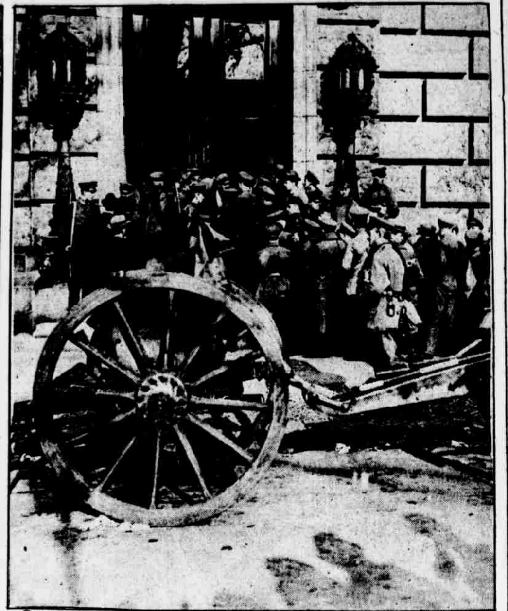
GERMAN SOLDIERS, DELEGATES of the Soldiers and Workmen's Council, waiting at the door of the Reichstag Palace for admittance to a conference with the leaders of the revolutionary government