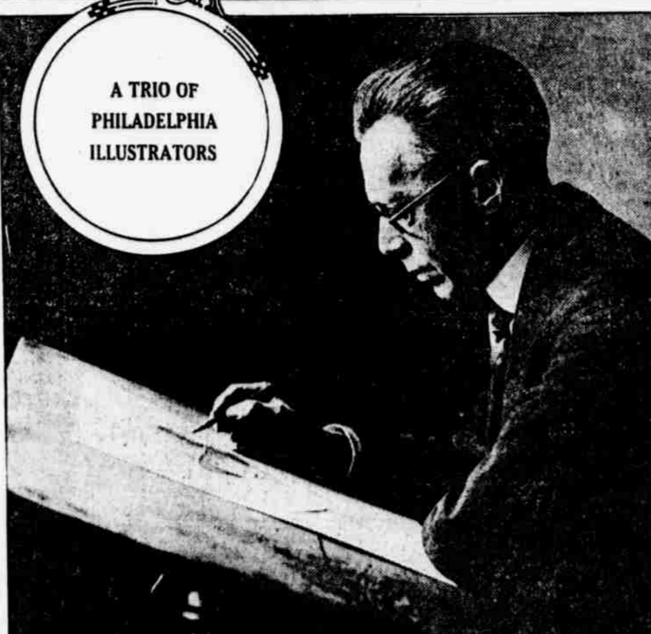
A TRIO OF PHILADELPHIA ILLUSTRATORS