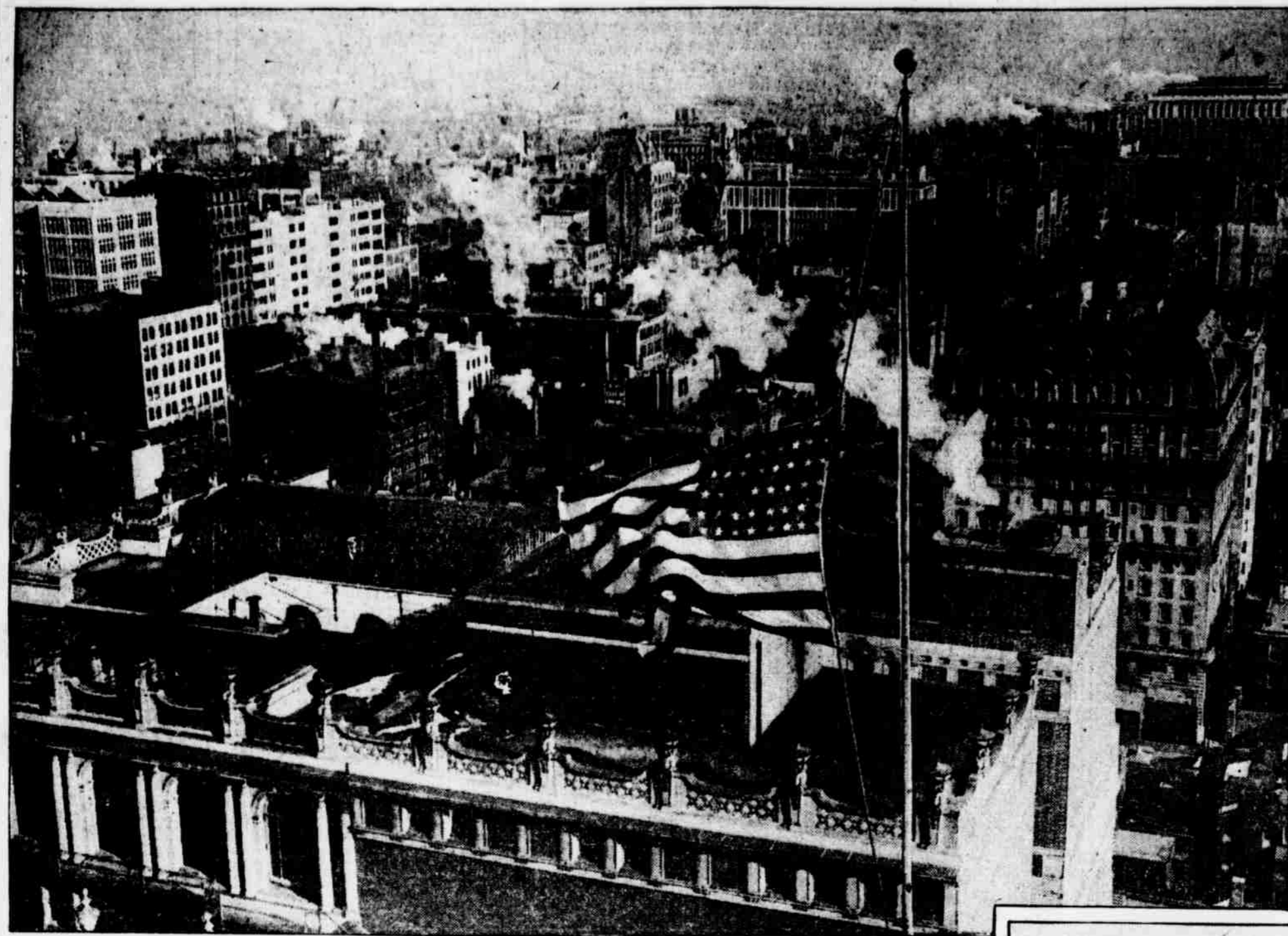
IN TRIBUTE TO THE MEMORY OF COLONEL THEODORE ROOSEVELT, PHILADELPHIA'S FLAGS ARE FLYING AT HALF MAST. A view of the city looking east from Broad and Walnut streets