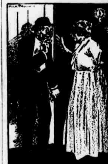
—Sydney Bulletin. Mrs. Soake—This is disgraceful. It's enough to make me divorce you. Mr. Soake—Don't trouble m' dear. Jush leah have an armistice to-night an' I'll abdicate tomorrow.