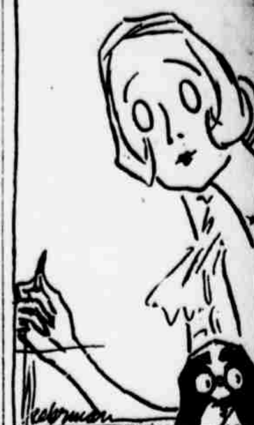
The young lady across the way says Liberty Bonds are certain to go above par after the peace agreement is actually signed and nobody ought to be alarmed because they're at a slight premium now.