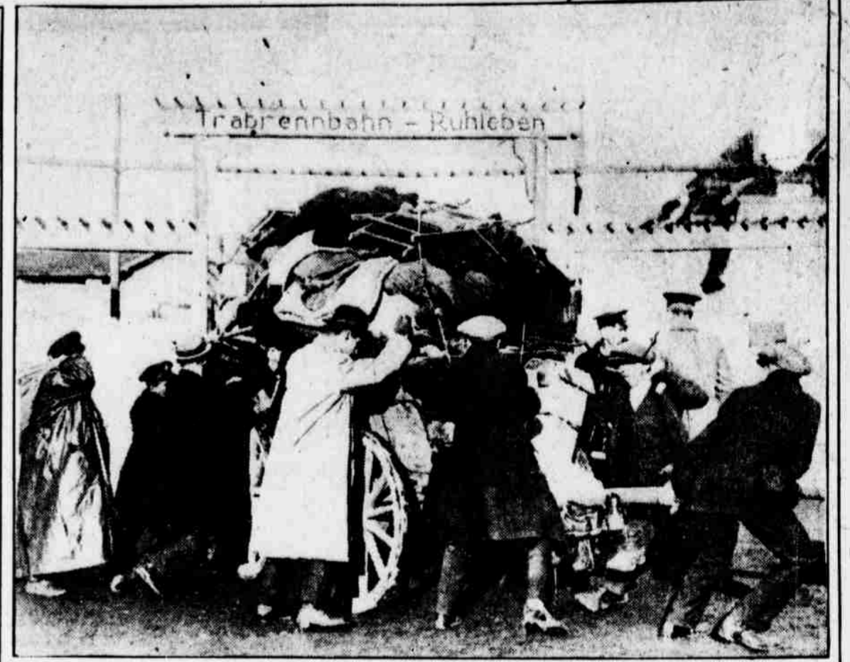
BRITISH PRISONERS RELEASED from the German prison camp at Ruhleben, with their personal belongings packed on a cart, ready to leave for the railway station for transportation to the Dutch frontier.