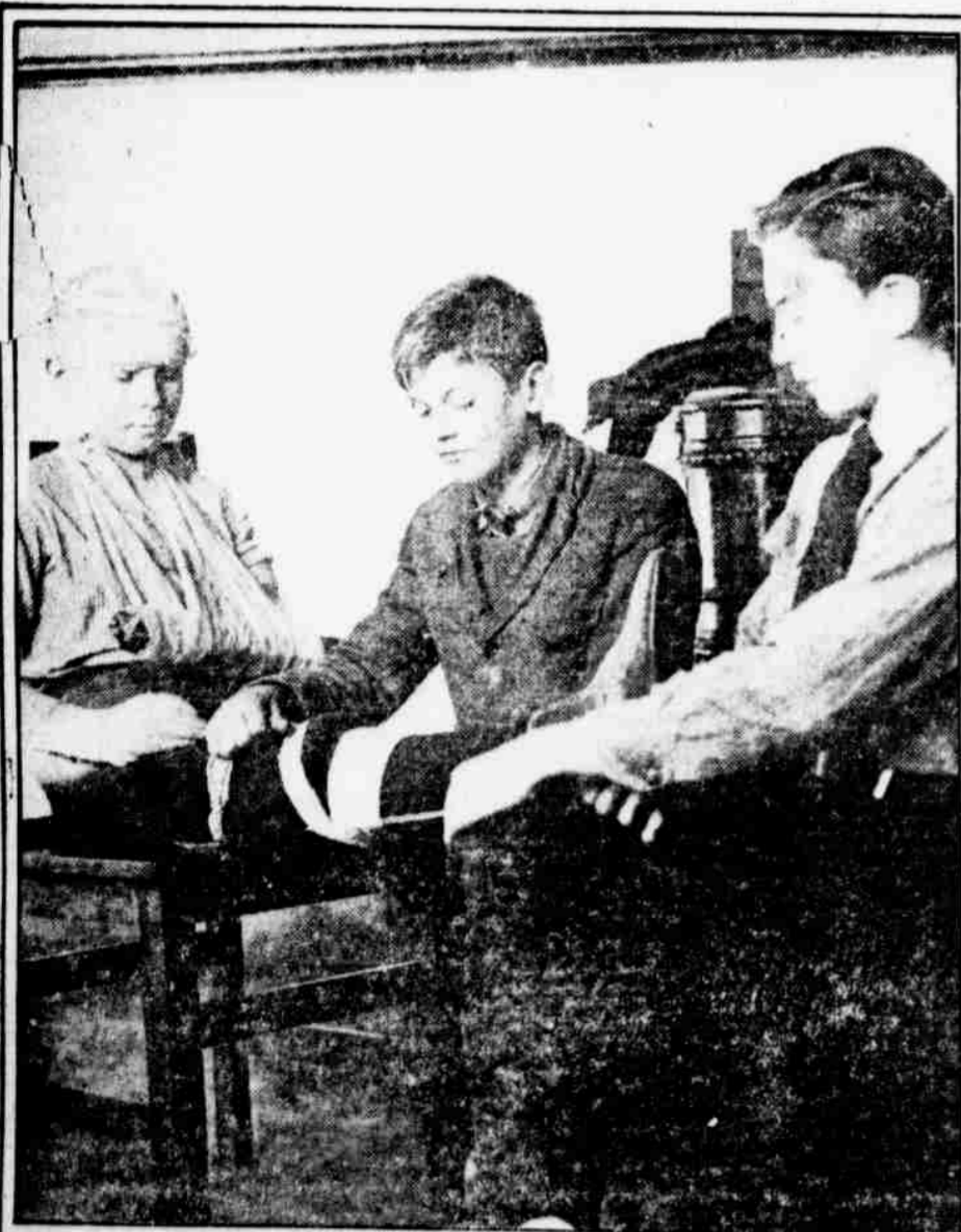
THE BOYS WHO PATRONIZE the Nicetown Club for Boys and Girls, Hunting Park avenue and Clarissa street, are taught how to give first aid to the injured.