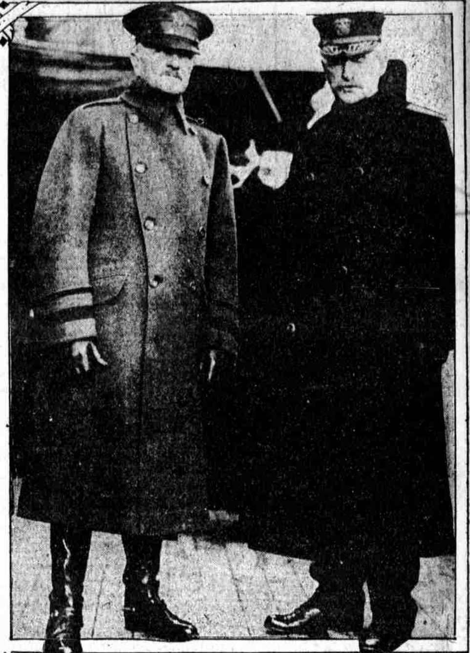
YANK LEADERS OVERSEAS on a dispatchboat going out in the harbor of Brest to greet President Wilson on his arrival in France. The soldier in khaki is General Pershing and the officer in blue is Admiral Benson.