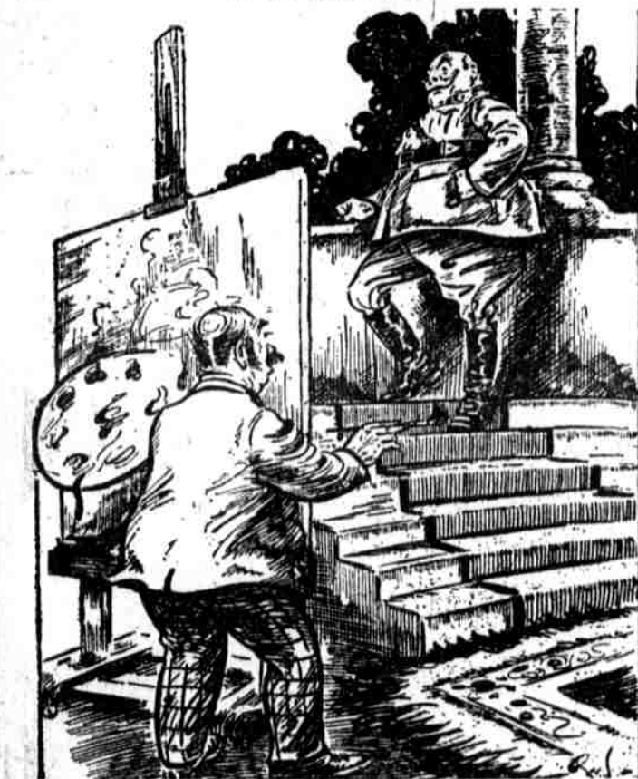
—The Passing Show. Portrait Painter—Well, what do you think of the armistice, General? General—Dashed glad the war's over; now I can do some soldiering again.