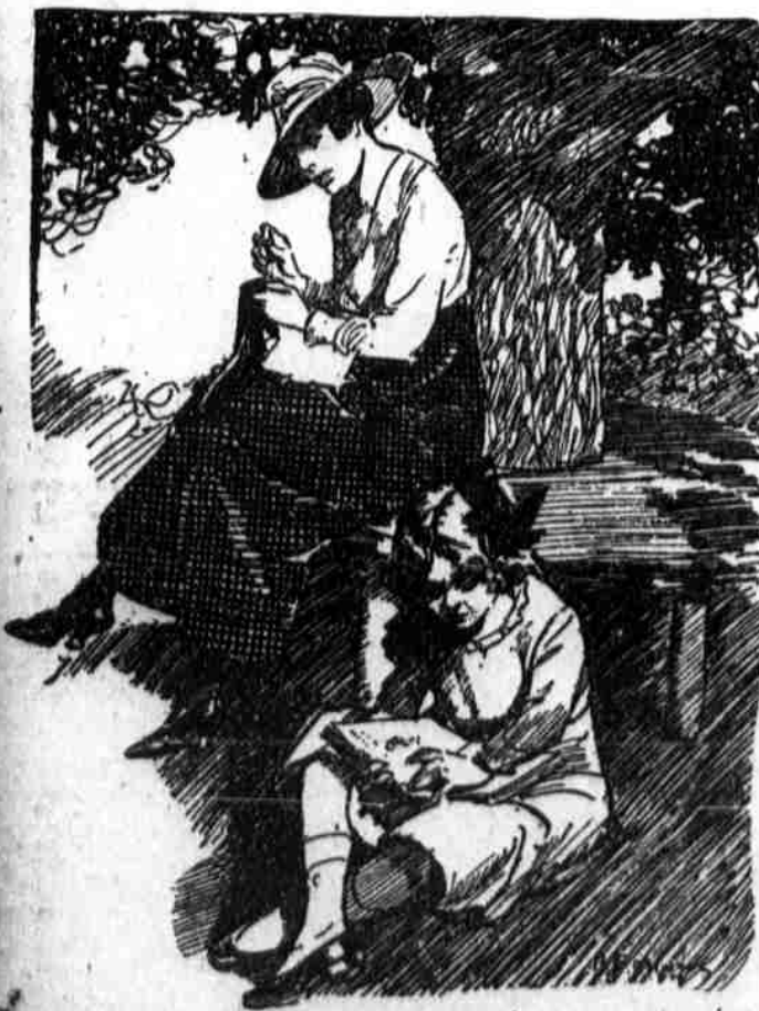
—Sydney Bulletin. Kid (continuing the story)—So the Fairy Prince and Blue Eyes were married and lived happily ever after. Mother, are you living happily ever after? Mother—Well, fear, I married a Merchant Prince. (Hurry!) Now read me the next story.