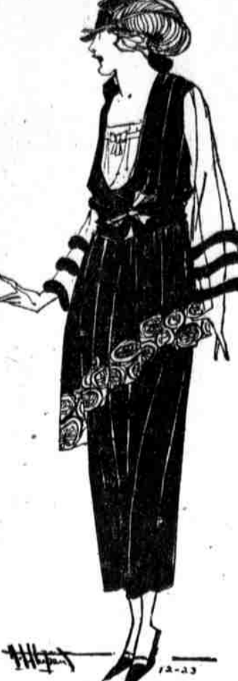
The foundation of this frock is black satin and the tunic, girle and chemise are of blue georgette.