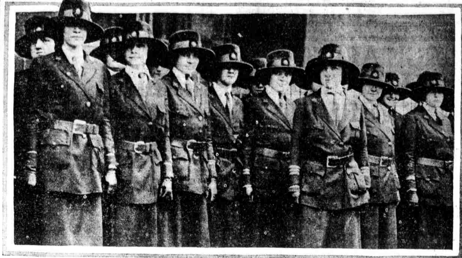
The Navy Auxiliary of the Red Cross, with headquarters at 221 South Eighteenth street, stands high in the list of Red Cross organizations that made a success of the membership drive. Nearly 1000 women representing the different women's war-work organizations which have been boosting the Red Cross Christmas rollcall drive marched in parade today