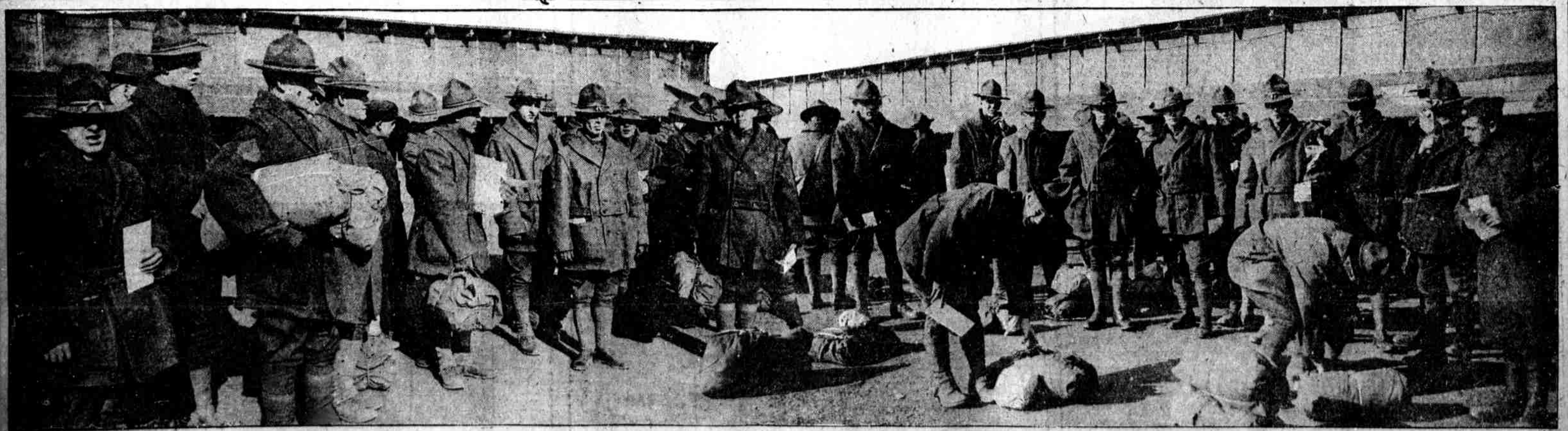
MUSTERED OUT AT CAMP DIX. HOME FOR CHRISTMAS. BOYS OF A TANK CORPS AT THE WRIGHTSTOWN CAMP WITH THE KIT BAG PACKED, THE ARMY DISCHARGE PAPERS SAFELY STOWED, READY FOR THE OLD HOME TOWN AGAIN