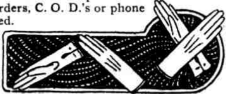
Frank & Seder—Street Floor

Washable Cape Gloves, lambskins and suedes. Some with embroidered backs. All sizes represented. No mail orders. C. O. D.'s or phone orders filled.