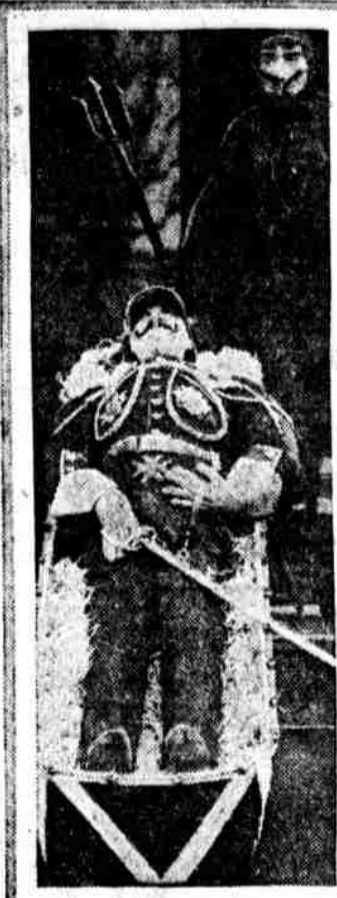
READY FOR CREMATION