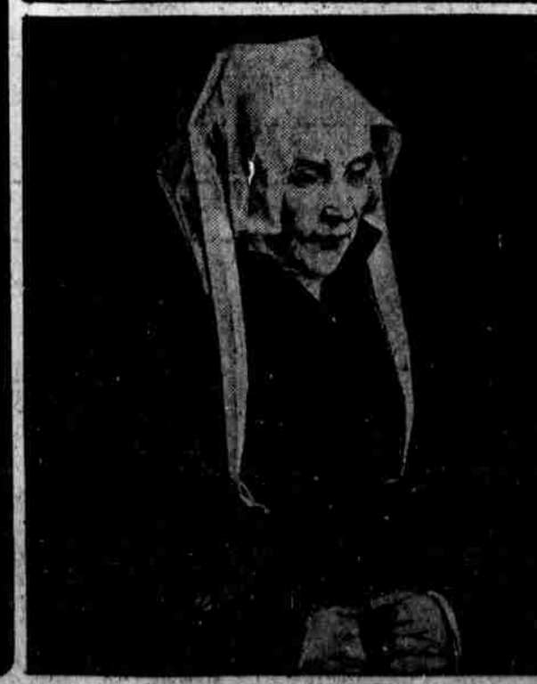
A DUTCH MASTERPIECE by Martin van Heemskerck (1498-1574)