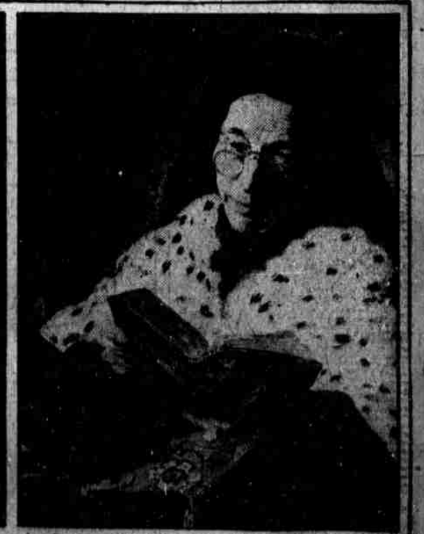
FROM THE BRUSH OF NICOLAS MAES (1632-1693).