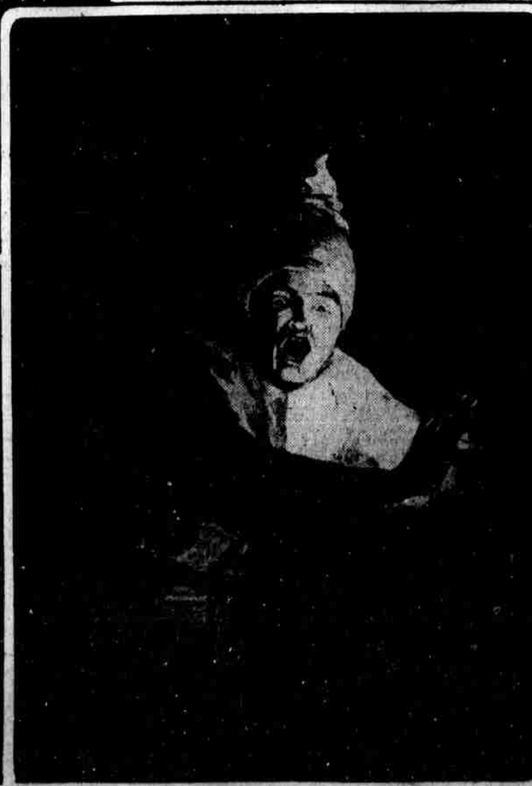
AN EXAMPLE of the French school by Chardin (1699-1779)