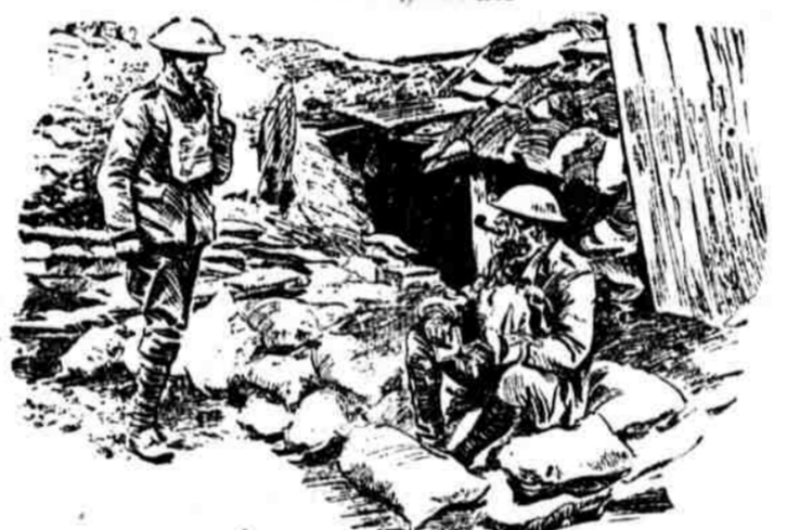
"D' you require a batman, sir?" "I have a batman." "You 'ad, sir; but he's just got a blighty."