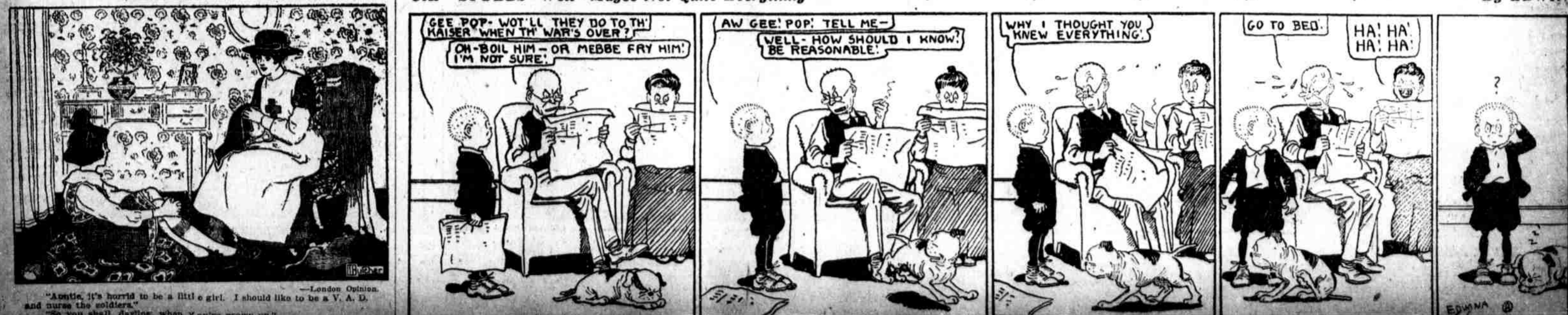
"Auntie, it's horrid to be a littl e girl. I should like to be a V. A. D. and nurse the soldiers." "So you shall, darling, when y'oure grown up."