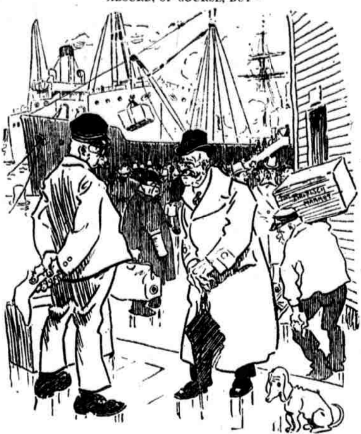
The Passing Show. "Hullo, there's a pretty big crowd going aboard. Where are they off to?" "Oh, merely Pan-Germans on their way back to England to claim their rights as British citizens."