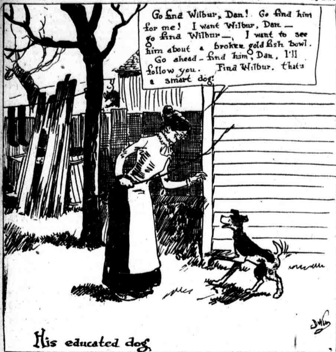
His educated dog