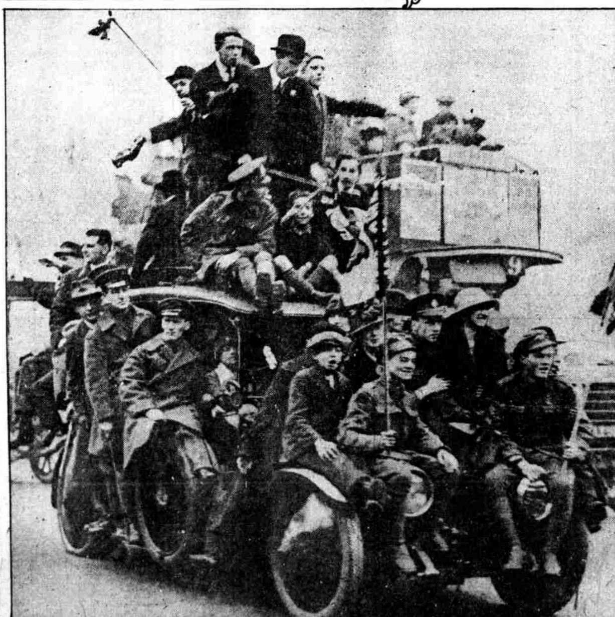
WHEN GERMAN ENVOYS SIGNED THE ARMISTICE people went wild with joy throughout London. Streets were filled with crowds, and vehicles, as above, were overfilled with happy riders