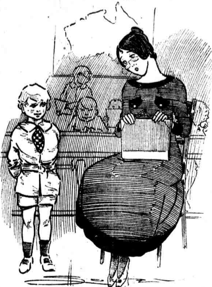
—Sydney Bulletin. Please, teacher, would you punish a chap for something he hadn't done? Certainly not, Billy. That would be unjust. That's all right, then, 'ause I didn't do my homework.