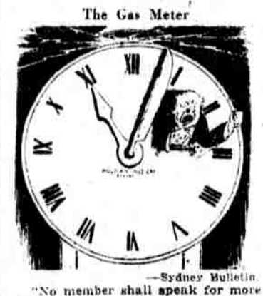
—Sydney Bulletin. No member shall speak for more than one hour and five minutes at a time on any question in the House. —New South Wales legislative proposal.