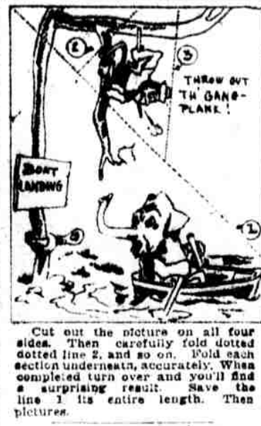
MOVING PICTURE FUNNIES