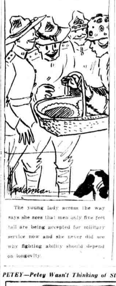
—Edwina. The young lady across the way says she sees that men only five feet tall are being accepted for military service now and she never did see why fighting ability should depend on longevity.