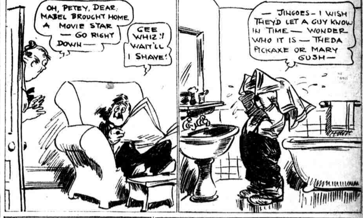
—C. A. Voight. OH, PETEY, DEAR, MABEL BROUGHT HOME A MOVIE STAR—GO RIGHT DOWN— GEE WHIZ! WAIT'LL I SHAVE.